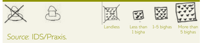
Figure 2 Example of an illustration of a question on land ownership on the question sheet

This map showed causal relationships and systemic feedback loops. The qualitative analysis of the pathways and indicators of change from the map and the clustered analysis generated three indicators of change over time and one diagnostic tool. Following the life stories exercise, we identified three indicators for repeated statistics: (1) prevalence and incidence of slavery and bonded labour; (2) collective action; and (3) access to health services. We also identified one indicator for diagnostic statistics – loan triggers.