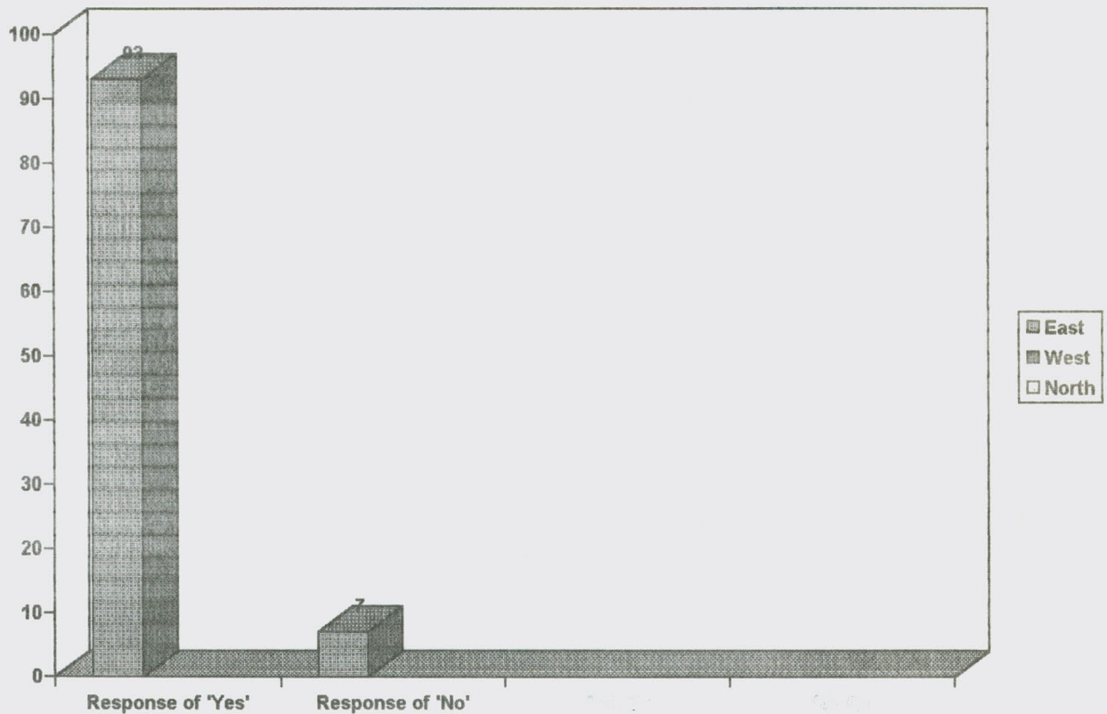
Fig. 2 Salary increment Vs no increment

The ratio of employees response for salary increment over no any increment has shown below in the help of graph.