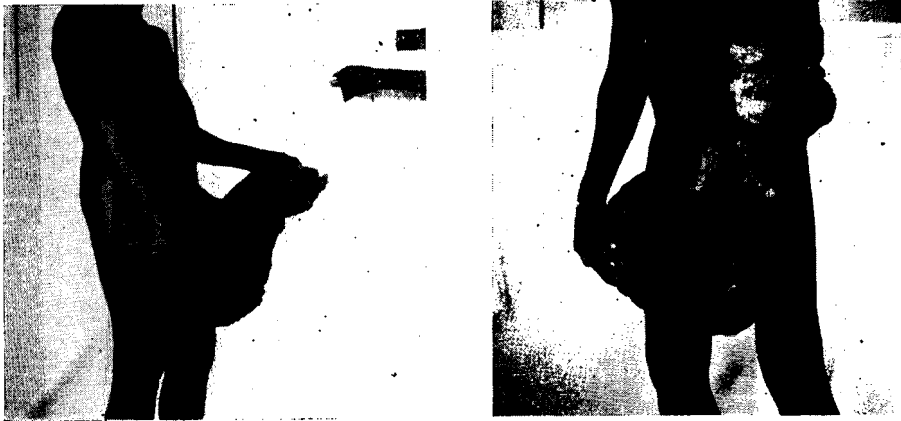
Elephantiasis of scrotum and penis. Removed under spinal anaesthetic. Weight: 28½ lb.

years, and as the patient came from an area where microfilaraemia has not been observed, it is probable that a different aetiology was present.