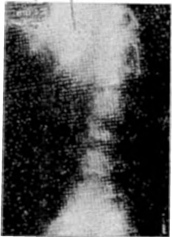
Fig. 1.—This shows the destructive changes present in the third and fourth lumbar vertebrae.

last child aged 3\frac{1}{2} years and also had had some haemoptysis for about one week three months prior to admission. On examination she was very thin and afreble with enlarged rubbery lymph nodes in the right inguinal region, but with no hepatosplenomegaly. Systemic examination of the other systems was negative. Over the region of the third and fourth lumbar vertebrae there was a marked gibbus with two sinuses discharging pus. Radiological examination showed normal lungs but destruction of the third and fourth lumbar vertebrae. (Fig. 1.) Other investigations showed a haemoglobin of 10.7C%, a normal white cell and differential count, normal serum electrolytes and urea, normal serum albumen with somewhat raised serum bilirubin Protein and casts were reported in the urine. The pus swab showed no growth anaerobically or aerobically. Antituberculous therapy was continued and a month after admission Mr. Roper operated on the patient finding a grossly diseased disc and abscess between the third and fourth lumbar vertebrae. The diseased disc was curetted and a sample of the