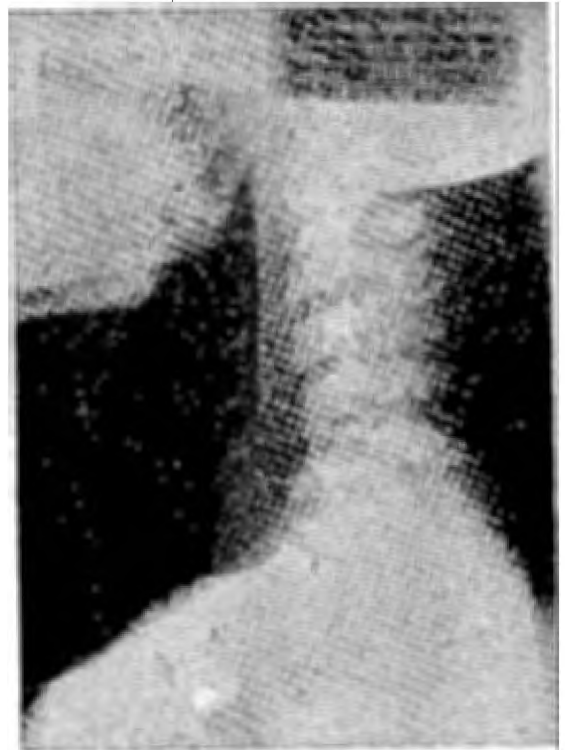
Fig. 4.—Gross destruction of C5.

The provisional diagnosis was bronchogenic carcinoma with bone secondaries but the general condition of the patient throughout his stay had been fairly good. The patient, who remained in hospital from 21.5.68 to 20.9.68 was afebrile except for very occasional rises of temperature