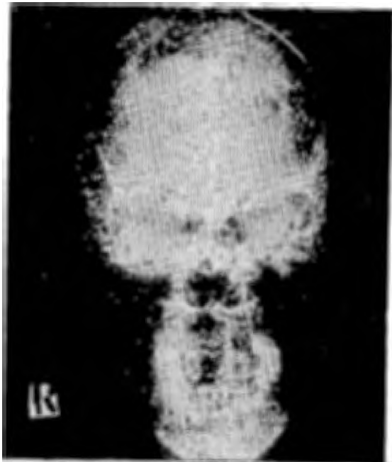
Fig. 5.—Notice the circular areas of destruction in the skull.

to 99° or 100° F. His E.S.R. was 84mm/one hour and haemoglobin 11.9G. Total leucocyte count 10 200.