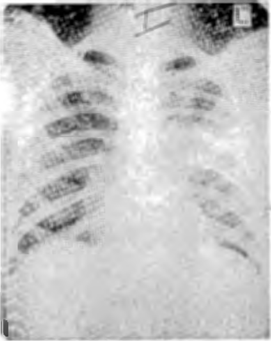
Fig. 3.—The lesion in the left lung extending from the hilum.

nevertheless the wound began to heal and it became very much smaller and without any further therapy the lesion on the back healed completely before the patient's discharge.