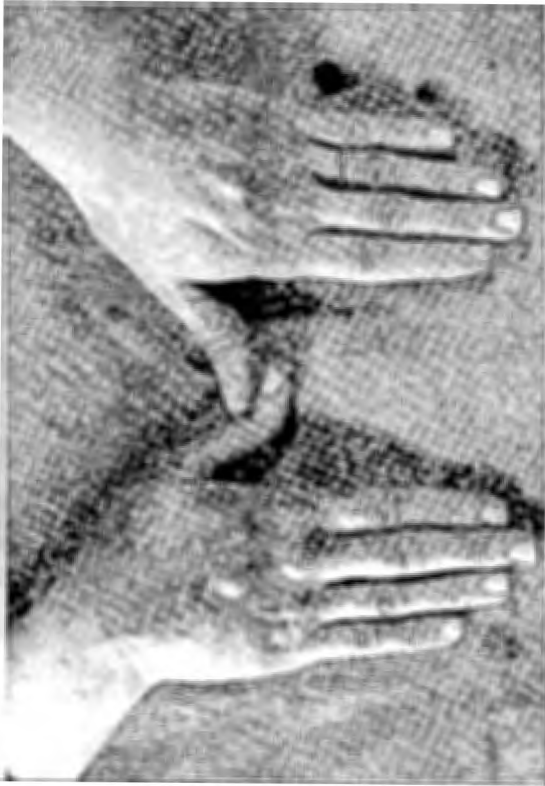
Fig. 2—Photograph to demonstrate extensive involvement of extensor tendons with xanthomata.

Investigations on admission showed the following: Haemoglobin, 9.5 gm. per cent.; total leucocyte count, 7,100 per cu.mm., neutrophiles, 68 per cent.; monocytes, 5 per cent.; lymphocytes, 24 per cent., and eosinophiles 3 per cent.; platelets, 460,000 per cu.mm.; prothrombin index, 98 per cent.; bleeding and clotting times were both normal. Serum iron was 20 micrograms per cent. and unsaturated iron binding capacity 380 micrograms per cent. Blood sugar was 92 mg. per cent., fasting total lipids were 630 mg. per cent., total cholesterol 236 mg. per cent., free cholesterol 62 mg. per cent., and a cholesterol:phospholipid ratio of 1.02. Fatty acids were 322 mg. per cent., triglycerides 35 mg. per cent., beta-lipoproteins 60 per cent. and beta-cholesterol 79 per cent. The serum protein bound iodine was 7 micrograms per cent.