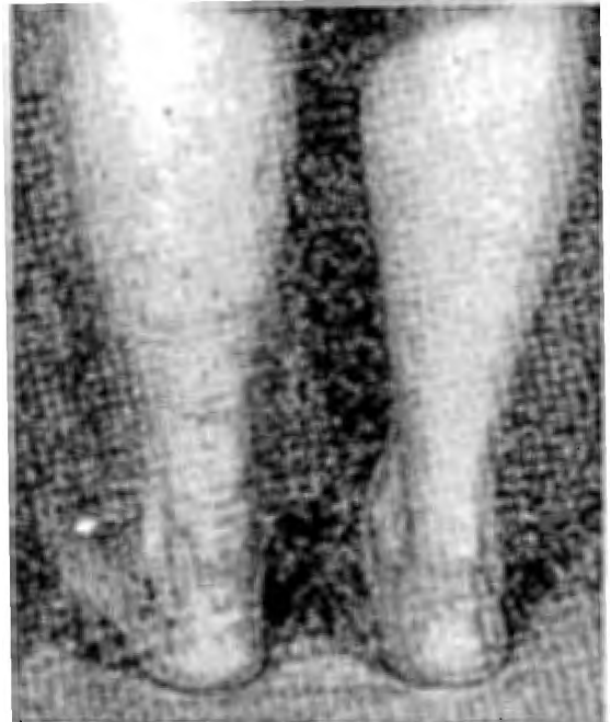
Fig. 1—Photograph illustrating grossly thickened Achilles tendons.

On examination the patient was pale and a well-marked bilateral corneal arcus was noted. The blood pressure was 125/60 mm. Hg. A grade 2/6 aortic ejection systolic murmur was audible at the base of the heart. The achilles tendons were markedly thickened (Fig. 1) and firm non-tender nodules were present in the extensor tendons of the index and middle fingers of both hands (Fig. 2). Varicose veins were prominent in the left leg and a chronic stasis ulcer was present just above the left medial malleolus. Rectal examination showed only the presence of melaena stool.