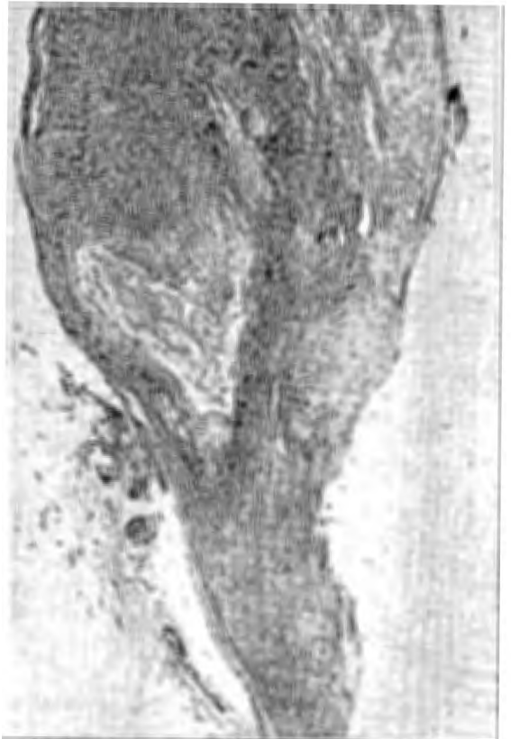
Fig. 3—Low power view of xanthomatous deposit in tendon sheath. Note the clefts normally occupied by cholesterol crystals.