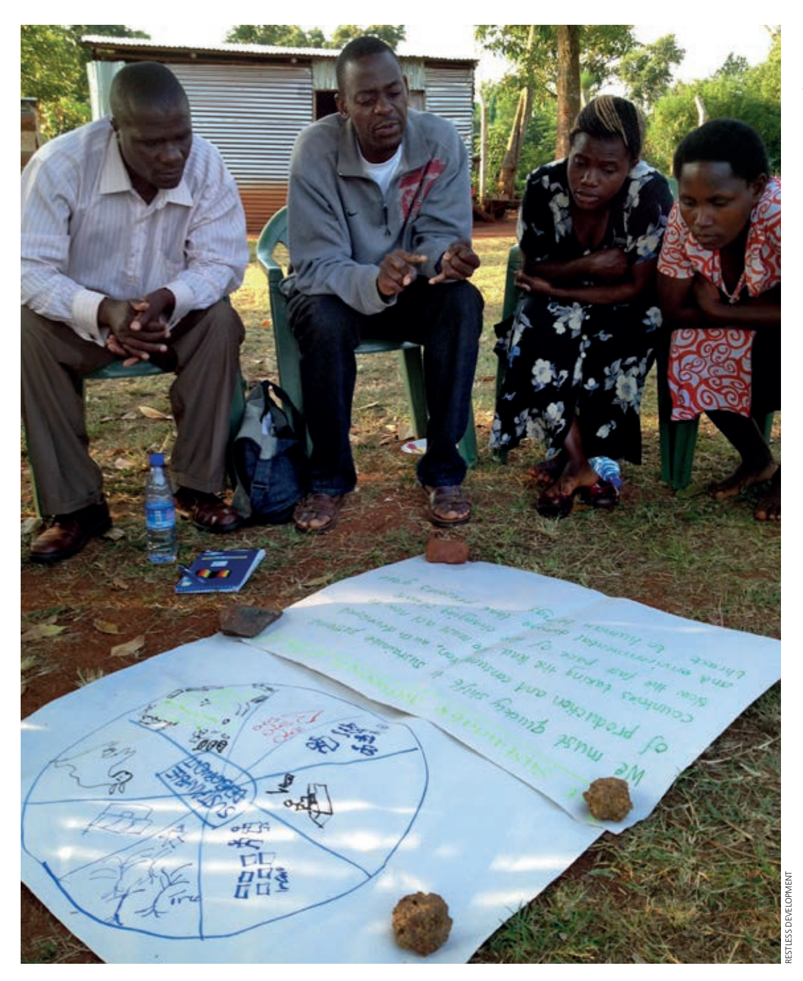
Ground Level Panellists in Uganda discuss what it means to 'put sustainable development at the core' as proposed by the High Level Panel