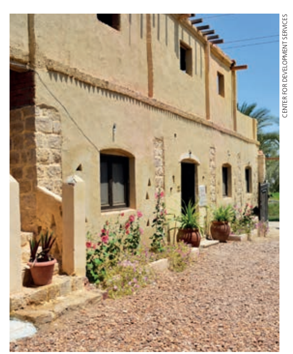
Egypt Ground Level Panel meeting: Tunis Village, Fayoum

The message of self-sufficiency was important across all of the panels, although it came out most clearly from Egyptian panellists. Countries and communities should have sufficient resources to develop: 'the poor can fulfil their own needs'. Uganda panellists echoed this idea; people must have the opportunity to determine their own development by having access to capacity and economic resources. The Uganda panel called for 'investors to support the communities in which