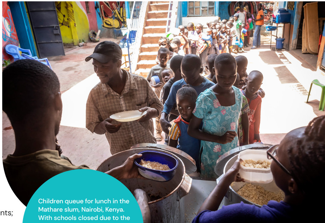
Children queue for lunch in the Mathare slum, Nairobi, Kenya. With schools closed due to the Covid-19 pandemic, various charitable organisations have stepped in to supply children with a free lunch.

People working in the informal sector were more likely to lose their jobs than those in the formal sector during the pandemic (Rohwerder 2020; FSIN and Global Network Against Food Crises 2021). Migrant informal workers experienced even greater restrictions and hardship than local informal workers (Ismail and Valdivia 2021; Juárez Padilla et al. 2021). A lack of social protection coverage for informal workers increased their poverty and food