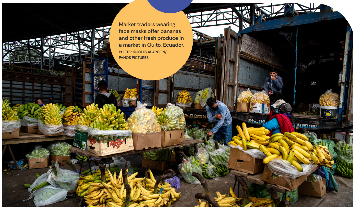
Market traders wearing face masks offer bananas and other fresh produce in a market in Quito, Ecuador.

To compensate for loss of incomes during the pandemic, households adopted coping strategies that could compromise their recovery capacity, such as selling assets or getting into debt (Thompson et al. 2021; Alfors, Ismail and Valdivia 2020). Households also reduced their food intake and/or reduced the amount of nutritious food they ate to cope with losses of income and increased food prices, which can have longer-term impacts on their nutritional outcomes (Thompson et al. 2021; FSIN and Global Network Against Food Crises 2021; HLPE 2021). The loss of livelihoods, and exhaustion of resources, created conditions for exploitation and abuse such as cases of transactional sex, early marriage, child labour, and human trafficking (Global Protection Cluster 2020).