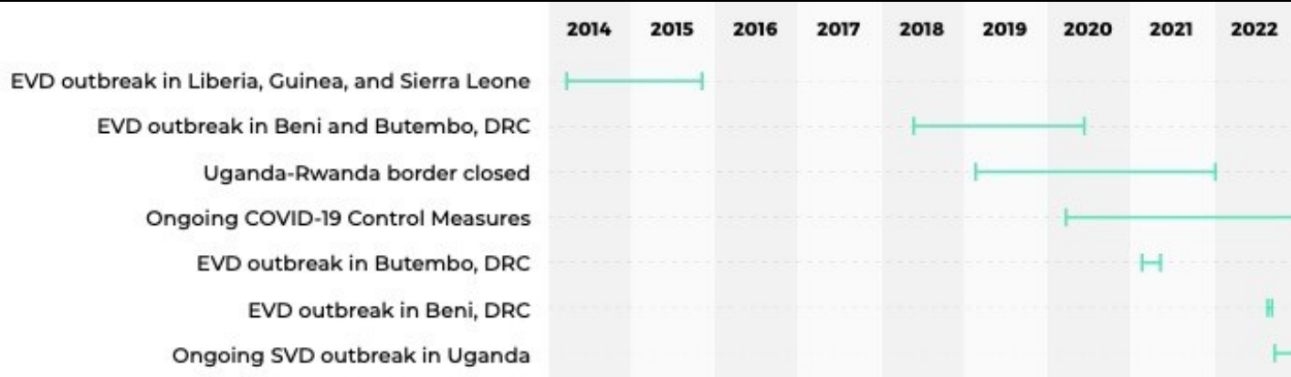
Figure 1. Timeline of previous outbreaks and border closures and control measures

Due to a high-level political dispute, the Uganda-Rwanda border was closed on 27 February 2019. With the exception of transiting freight vehicles, the Rwandan government prohibited Ugandan and Rwandan nationals from crossing the border other than in exceptional circumstances. This created a temporary livelihood crisis in border districts where residents relied on cross-border trade. 11 The closure was enforced, at times forcefully, by Rwandan security forces. This situation extended through the COVID-19 crisis, and the border only formally reopened in January 2022. 12