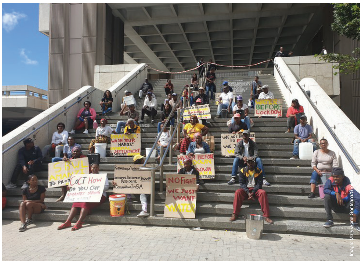
Residents from several informal settlements in Khayelitsha gathered on the steps of the Civic Centre in Cape Town to demand that they be supplied with water during the 21-day lockdown

President Cyril Ramaphosa's initial COVID-19 national addresses conveyed the sense that the pandemic would overwhelm the country's healthcare system and economy if difficult, firm and swift decisions were not taken. Through this discourse, protests can easily become viewed as threats to a carefully managed crisis situation and as potential 'super spreaders' of the virus – situations that had to be confronted with great urgency. This was despite indications that many protestors adhered to COVID-19 regulations whilst protesting.