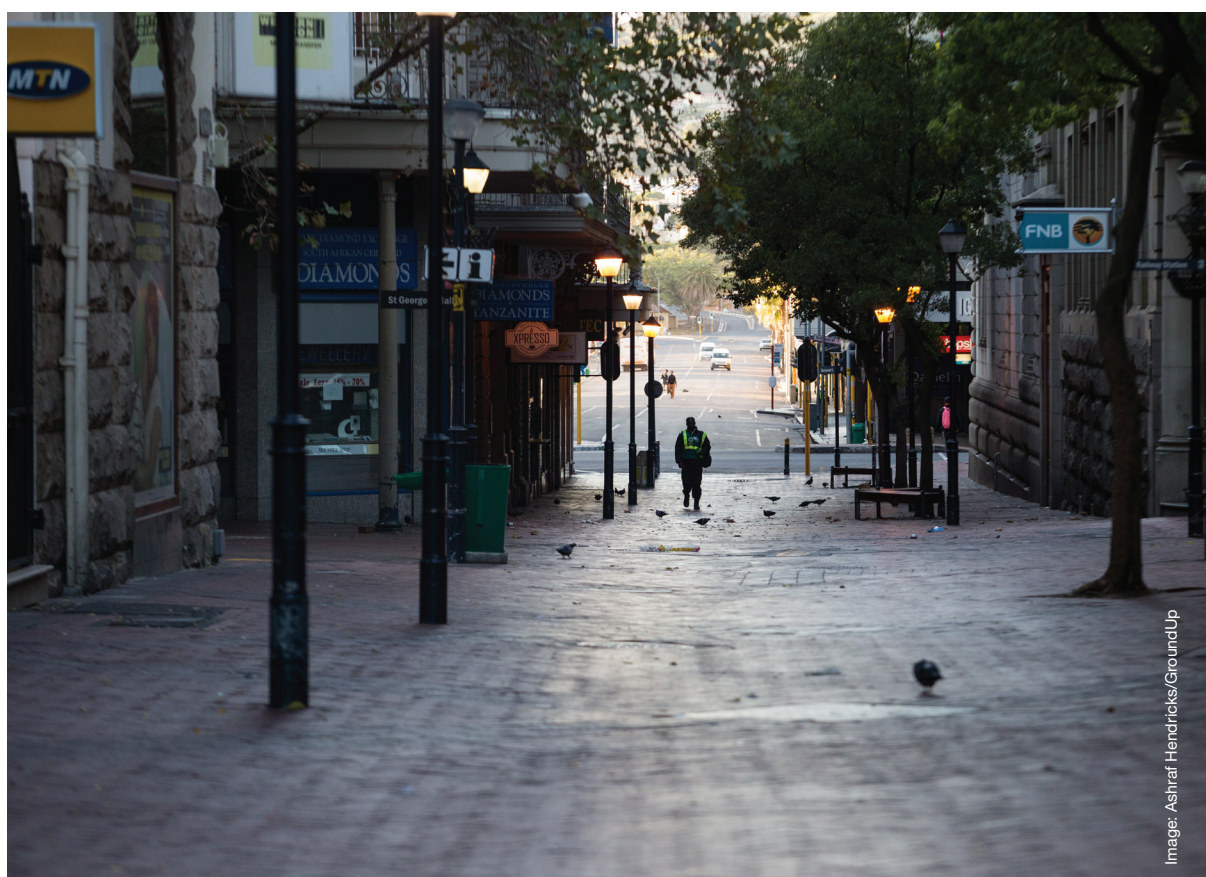
Residents in South Africa are asked to stay indoors to prevent the spread of Covid-19.

An international analysis of policing responses to COVID-19 also highlighted how the increased use of force, during the pandemic, was a pandemic in itself. This increased use of force was highlighted in Kenya, where the country's Independent Policing Oversight Body investigated 87 complaints and 15 murders attributed to police action between March and June 2020. In Nigeria, security forces were reported to have killed at least 28 civilians, while 873 cases of police brutality were documented between April and June 2020. 6 Reports by the United Nations' Human Rights Council also highlighted disturbing militarised responses to the COVID-19 pandemic in countries such as the Philippines, Sri Lanka, Iran, and Hungary.