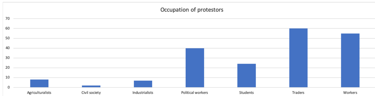
Figure A2 Occupational profile of protestors