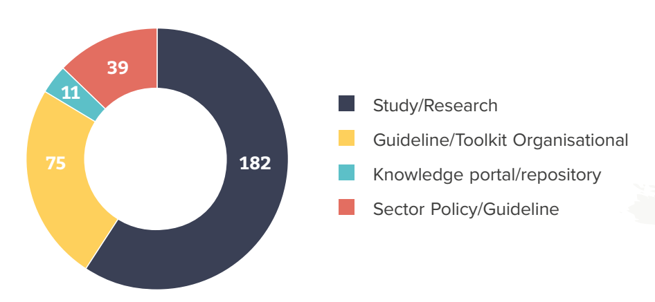
Figure 1: Typology of the resources identified in this study

The document collection process (described in <u>Section 2</u>) led to over 300 documents being identified. This not an exhaustive list of what is available in the sector, and we only consulted a sub-set (around 180) of these resources during this study. However, all 300+ documents were catalogued, and basic attributes identified. This allowed quantification of various attributes of the resources, presented in Figure 1 and 2.