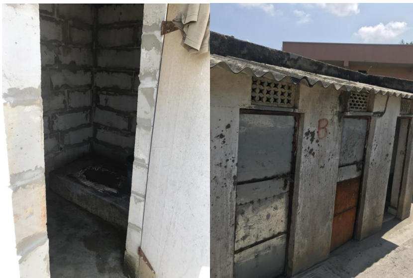
Figure 4: Pictures of row toilets that have been constructed for households with rocky areas.

13. During the focus group discussion in one of the GPs, members were asked if they had seen or experienced any of the leach pit toilets getting filled up. None of them said that they had actually experienced or seen this happening but on further probing said it was only the septic tank type toilets with fully plastered pits that filled up and had to be mechanically emptied. They had mostly heard from different sources that the small pits of a government toilet fill up fast. They also mentioned that they did not know of toilets that have been in use for several years so did not know about them filling up.