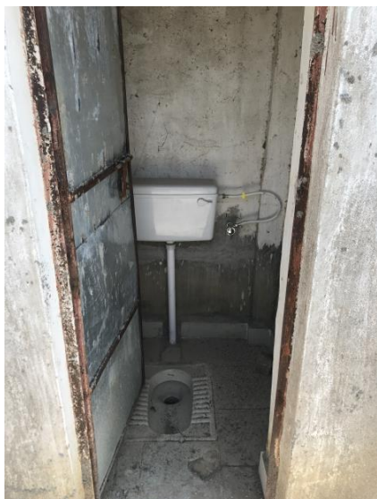
Figure 3: Picture of a newly constructed latrine closed by the owner

12. Row toilets as seen in the pictures below, were constructed for households that had no space or were in rocky areas, however these were not being used or maintained. They were also to be shared by two households for each toilet and there was no discussion on this aspect with the households.