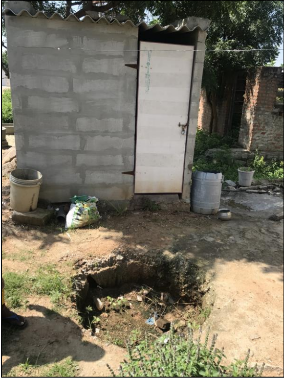
Figure 2: Picture of a toilet with a fully constructed superstructure without a substructure as hard, rocky area was encountered

8. While twin pit toilets are suitable for most places, they may not be suitable for rocky surfaces and high water table areas. This aspect was not known or taken into account when constructing these toilets, as they were largely rocky surfaces in this GP particularly for the newly constructed ones. As it was a contractor driven program and the GP leaders had to meet targets, some households had a fully constructed superstructure without a substructure, as it was impossible to construct leach pits. Figure 2 illustrates this.