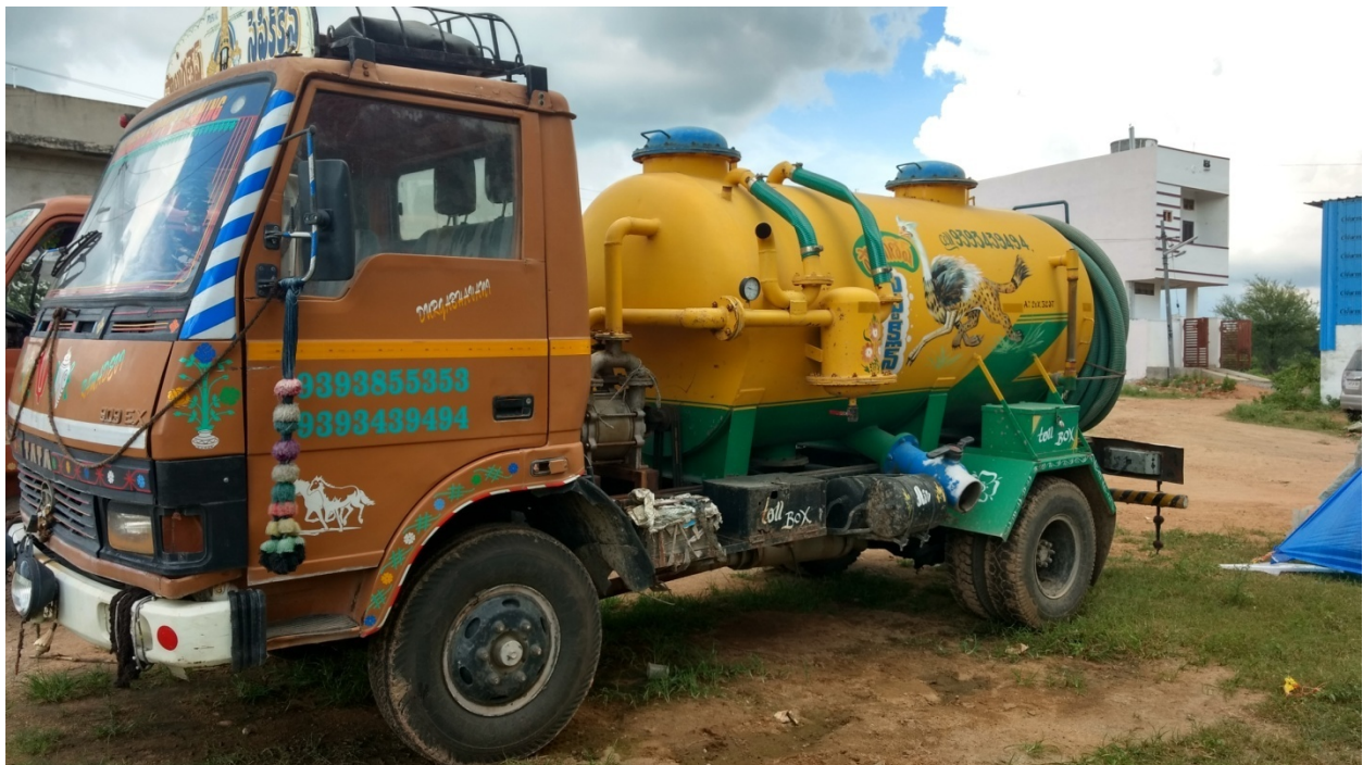
Figure 5 Tanker for fecal sludge collection and disposal

A detailed interview with a private agency in UP (Fig 5) which removes fecal sludge mentioned that in a month the agency gives services for 8-10 days. The agency provides services to both rural and urban areas. The cost is around INR 1000- 1200 per household. The amount is same for both urban and rural areas. The septic waste is removed from the tank using a pipe which is 5-inch diameter fitted on the valve of the tractor. After the tanker is filled, the waste is carried to agricultural land and it is spread around the boundary of the land. Mostly this is done for the sugarcane plantation. The agents mentioned that the farmers usually contact them for purchasing the manure and it costs Rs.500 for the farmer. The waste is collected and carried by 2-3 labourers who are the permanent staff of the agency. When the workload is high, the labour is hired on a temporary basis. Sometimes the work has to be done by the hand and the smell is unbearable. However, most days they do not have work.