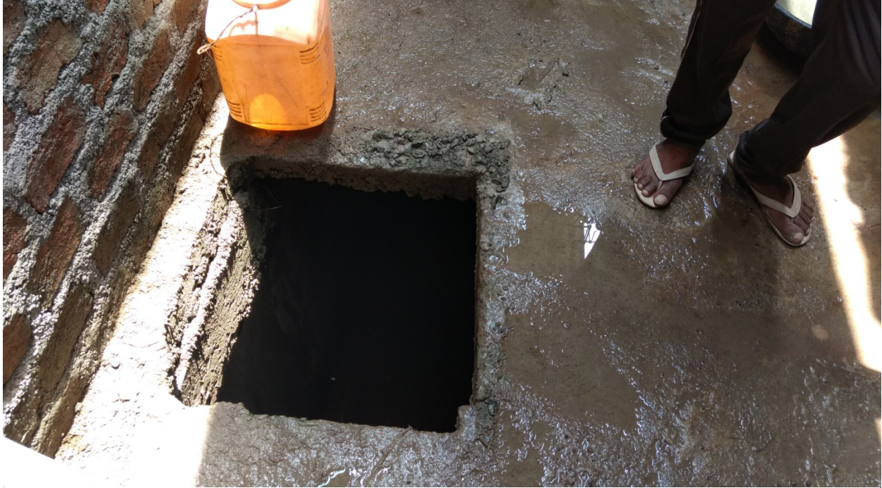
Figure 2: Single chambered septic tank.

Masons, single-chambered offset septic tanks are predominant. Most of these structures are leach pits which is also called as septic tanks by locals but lack either sidewalls, cemented floor or soak pits. Out of the total households (456) in the selected village, only 70 households went for chambered septic tanks with walls, outlet and soak pit. In Telangana, at Kamareddy, just 20 to 21 septic tanks are built in the entire village. New construction of septic tanks is almost none. Currently, much emphasis is given to the creation of twin pits. Soak pit is absent in all of these septic tanks. In the Baigunia village in Odisha, only the settlers from outside the village built septic tanks. All others use leach pits or twin pits. In Madhya Pradesh, the village had at least 50 septic tanks with varying sizes. The size variation here is dependent on the space availability. In some houses, the septic tanks are single chambered tanks constructed inside the house under the room to save space (Fig. 2). In such cases when asked about the fecal sludge management, the respondents said that when the tank is full the floor will have to be broken or a connection pipe will have to be constructed through which the fecal matter can be removed using the suction pipe in the tanker. The sludge emptying services are hired from the nearby towns (see section g).