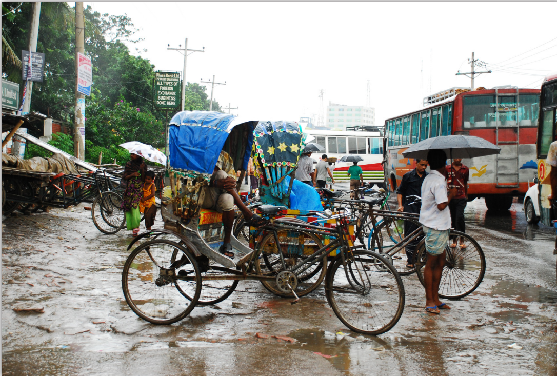
Sheltering from the storm, Bangladesh

All four studies engaged with non-academic stakeholders through a formal project advisory board or consultative group, which met regularly throughout the project's duration. Structured engagement in this way increases interest, encourages inclusivity and develops trust. Communication is two-way: a number of projects reported that the groups shaped their study's objectives and strategies.