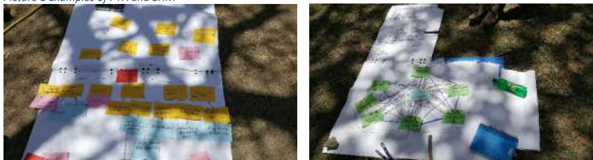
Picture 1 Examples of PTA and SHM

A final method for data collection that was included in this research is participant observation. Participant observation was undertaken in one kebele in each woreda (see Annex 1). Observation was undertaken by one fieldworker over the course of five days and consisted of observing PSNP and IN-SCT-related activities in the kebele as well as nutrition- and hygiene-related practices as supported by the IN-SCT. It also included unstructured conversations with clients, community members and service providers. Fieldworkers were trained and supervised ahead of their five-day observation period, were conversant in the local language and used a daily reporting template to record observations.