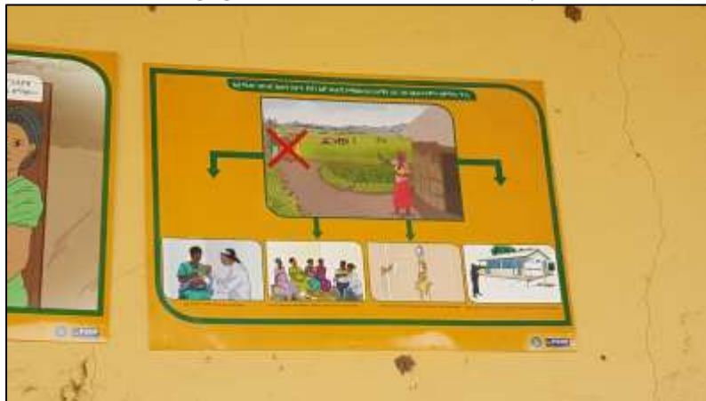
Picture 2 Visual messaging on TDS at Udana Cholkosa health post, Halaba woreda

Awareness of the services provided by the HEW are high across all client groups, despite not necessarily everyone having benefited from them directly. Male PW clients are aware of the services provided to TDS and PDS clients related to antenatal and postnatal care and children's health. TDS and PDS clients as well as female PW clients have more direct engagement with the HEW through home visits, receiving nutritional supplements for the children as well as tailored awareness raising on BCC issues such as hygiene and sanitation, child feeding and breastfeeding. Comparatively, TDS clients receive more intense services . These are in line with co-responsibilities and focus on children's health, including the provision of food supplements, information on how to prepare nutritious foods for children and pregnant women, as well as conducting regular health check-ups on children to assess their nutritional status. For pregnant women, the HEW provides antenatal and postnatal care and information, including advice to ensure a safe delivery.