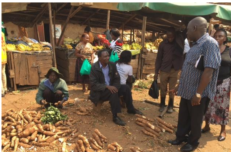
A vendor with a disability at an urban market, selling on the floor. The stalls at the back are expensive to build and rent

Despite vendors paying a fee for using the market space, most of the business activity in the Tier I and Tier II markets is considered ‘informal’. Following the principles of everyone is treated ‘equally’ there is no special treatment (concessions) for persons with disabilities in the market place. They pay the same charges as others. This perceived equal treatment results in many unequal outcomes for persons with disabilities, as pointed out