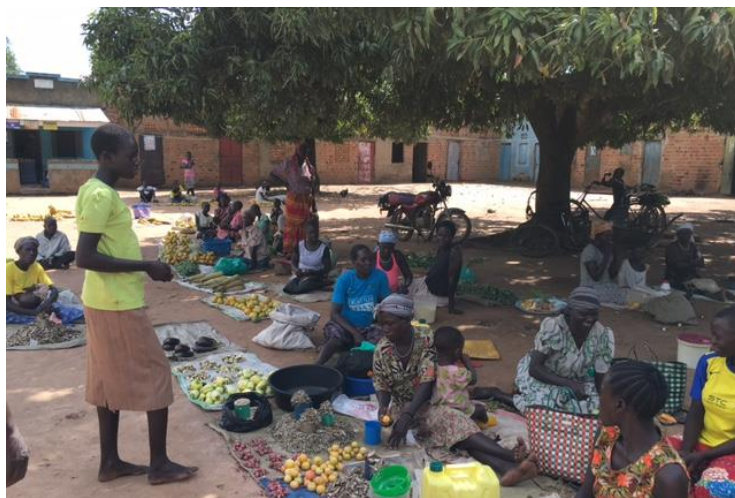
An informal Tier II market in Gulu district

Informality: The majority of traders in the Tier I and II markets operate informally. They typically buy farm products like beans, sesame, peas, sorghum, soya bean and maize directly from the farmers. When the quantities are less, they are sold in measuring cups (measurement of the volume not the weight). The weight is only measured when the quantities are large. As a result the small producers lose out because the prices offered per cup are less as compared to prices by weight. For