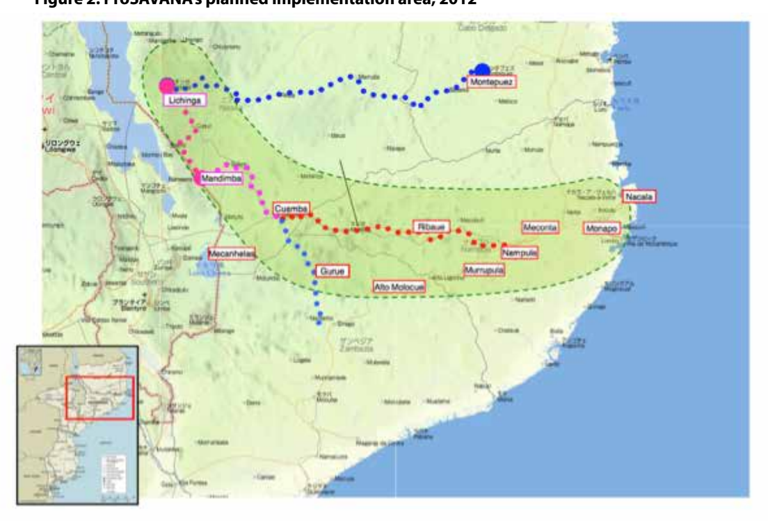
Figure 2: ProSAVANA's planned implementation area, 2012