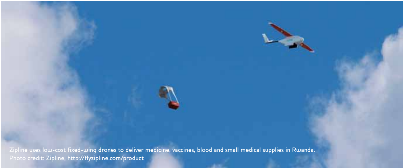
Zipline uses low-cost fixed-wing drones to deliver medicine, vaccines, blood and small medical supplies in Rwanda.