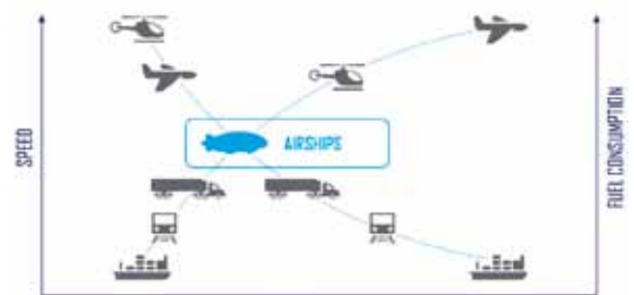
Figure 10 Positioning of airships

The potential is not limited to developing countries. NASA analysis suggests that Alaska and northern Canada may be among the best initial markets for airships. 214 Around 82 per cent of Alaskan communities are not currently served by a road network, while the whole of