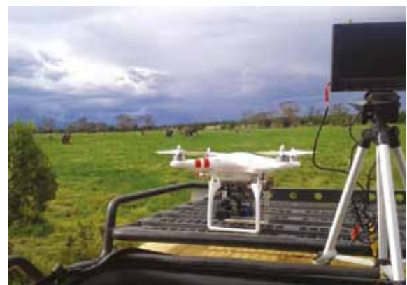
AfricanskyCAM uses multirotor UAVs to get high resolution video and imagery of news stories in real time as they unfold.

A UAV is simply an aircraft without a human pilot on board. UAVs operate with various degrees of autonomy: either under remote control by a human operator using radio frequency or satellite remote network connections; or intermittently or fully controlled by on-board computers. UAVs emerged from military applications, but their use is now expanding in commercial, scientific, recreational and a whole host of other applications. In fact, civilian and commercial drones now vastly outnumber military drones, with estimates of over 4.3m sold globally in 2015. Civilian UAVs can be classified according to their size – ranging from mini-drones through to people-carrying drones – the altitude they can reach, and their range or autonomy. 159