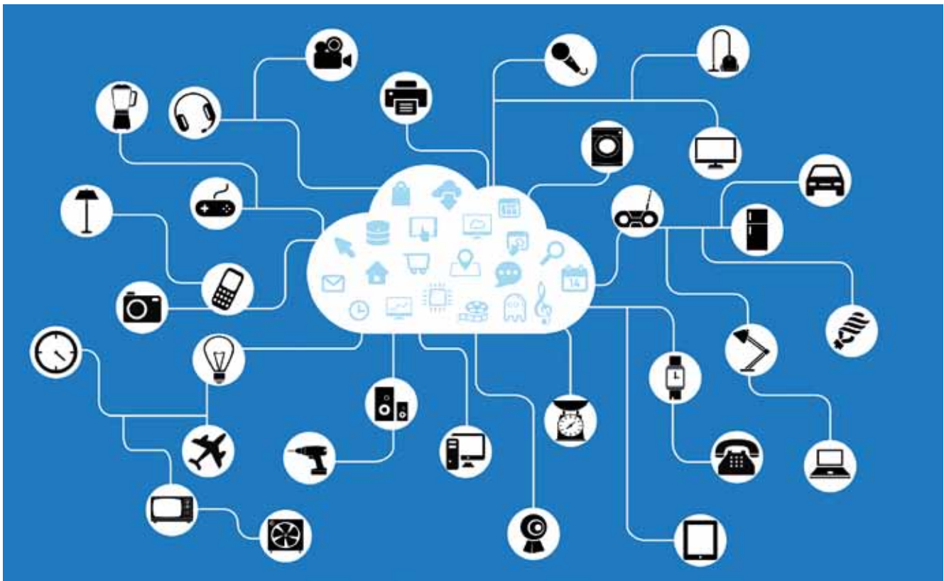
Figure 8 Range of devices connected to the internet of things

The more things and services are integrated into the Internet of things, the more value that can be extracted from them.