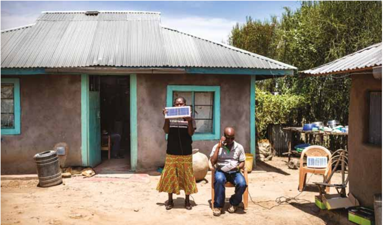
A technician from M-KOPA, a Kenyan based company specialising in low-cost solar lighting, installing and activating a solar lighting system in a rural property. This works thanks to mobile money and sensors connected to the Internet of things.