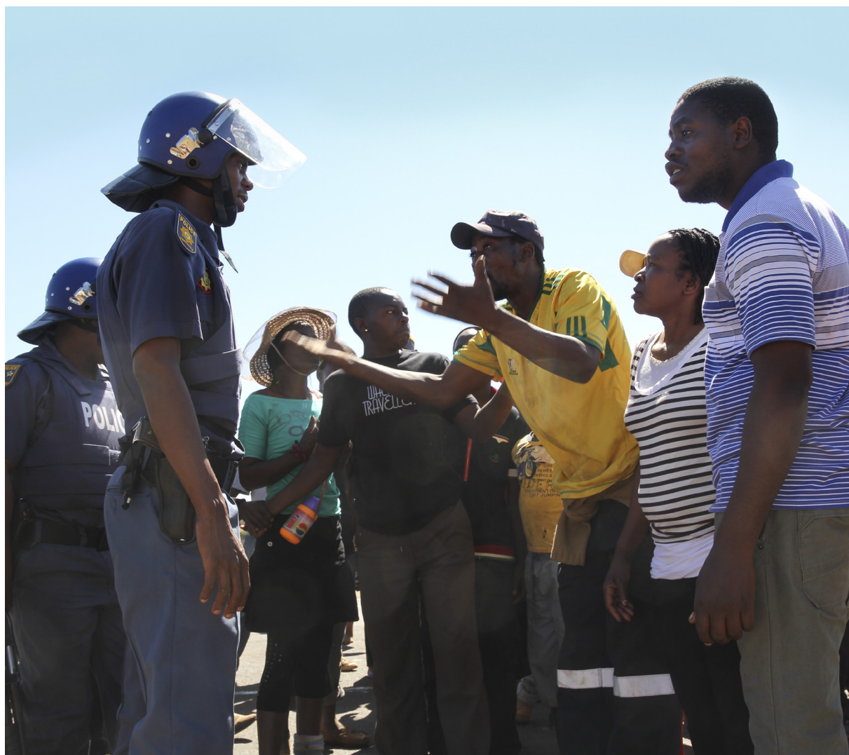
Residents of Thembelihle informal Settlement, South Africa, protest against inadequate services in 2011.

As one black woman activist – whose house was burnt down for blogging about campaigns against corporations, and who has been threatened for writing about whistle-blowers – observed, “complete transparency is a nice idea for white men in the suburbs... Whiteness protects people in South Africa and it is a white lens through which this idea of transparency is seen. It is also a gendered lens... I need to speak anonymously sometimes.”