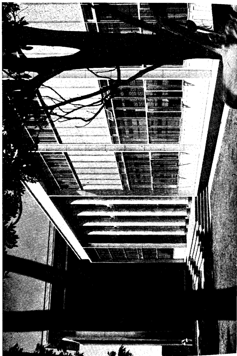
Main Library, University of Rhodesia.