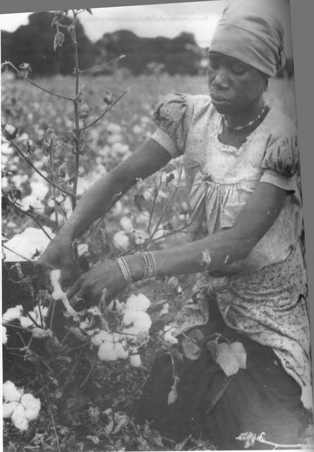
Smallholder cotton has always been of high quality as it is hand-picked