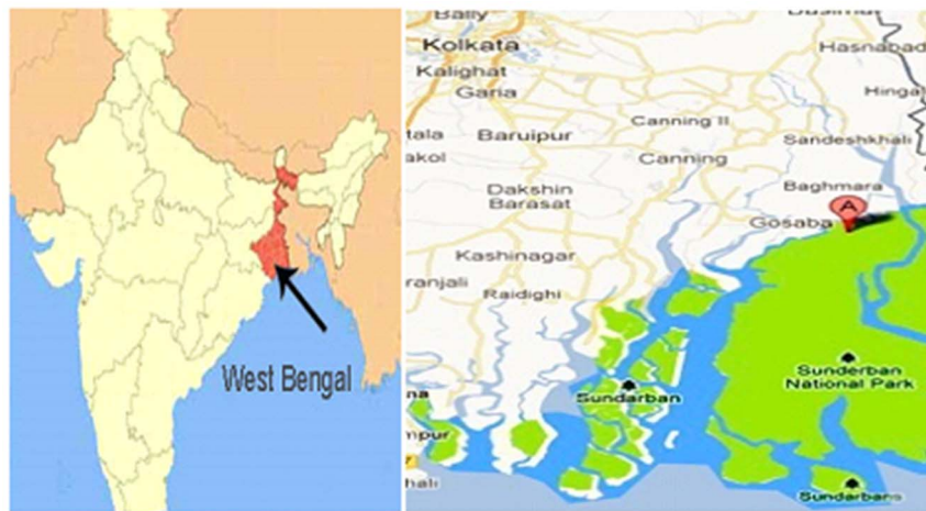
Figure 1. Study site: A mark on map (not on scale) depict the actual local of the study area, Sundarbans, West Bengal, India. doi:10.1371/journal.pone.0105427.g001

assessment of the impact caused by these sudden and extreme events and alternative coping measures employed. We describe these in detail while elaborating on the focal points of the paper below.