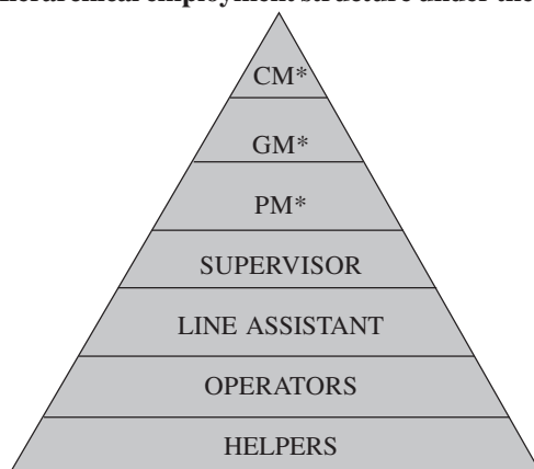
Figure 2. Hierarchical employment structure under the stitching unit

* CM - Chief Manager, GM - General Manager, PM - Production Manager