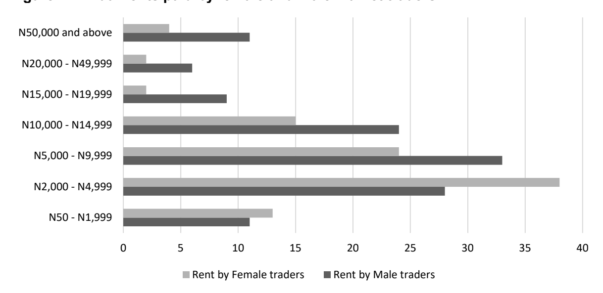
Figure 1 Annual rents paid by female and male market traders