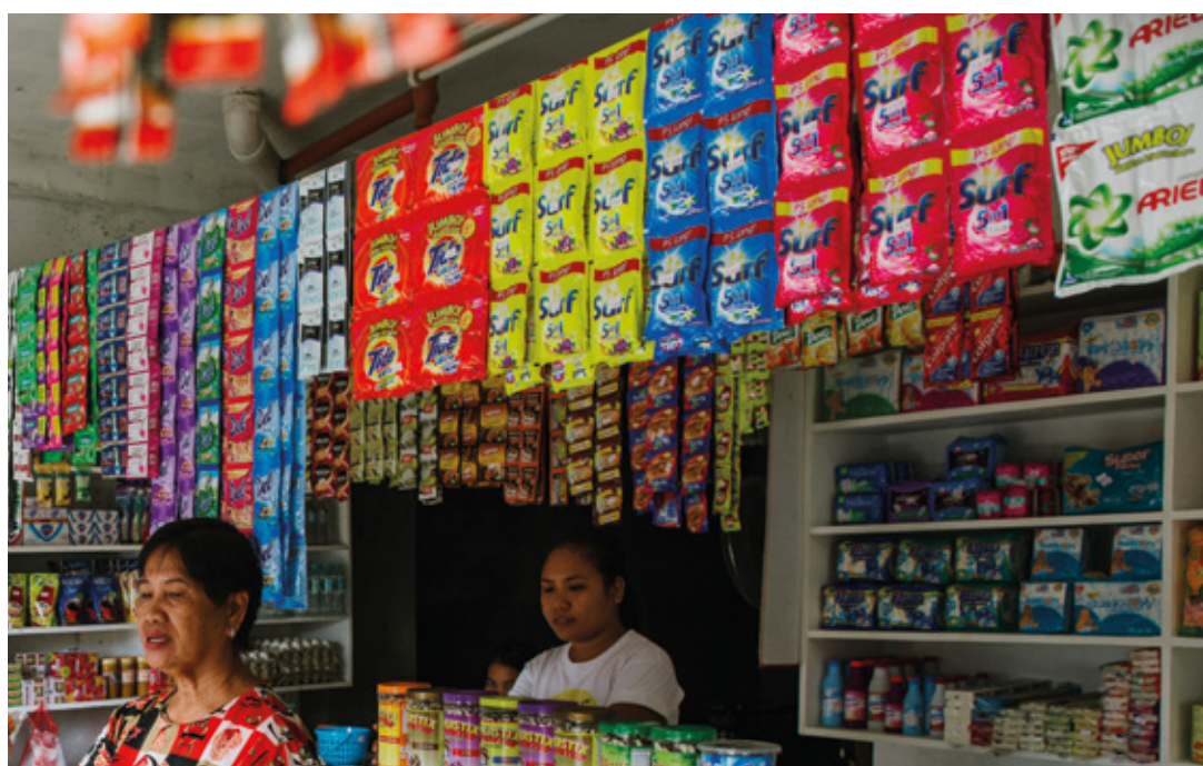
📷 Non-recyclable plastic sachets are sold in huge quantities across many low- and middle-income countries.

But while sachets may bring convenience, and – in some places – a level of affordability, they are a significant contributor to the waste crisis in many poor contexts. In Tearfund and WasteAid's survey on the impacts of plastic pollution on poverty, 137 plastic sachets were the most commonly identified item among mismanaged solid waste. The scale of the problem is also apparent from waste audits. For example, in a waste and brand audit carried out in the Philippines, a total of 54,260 pieces of plastic waste were collected, with most products being sachets. 138 The prolific use of sachets in many parts of Asia and Africa has been justified around arguments of accessibility: many families are unable to afford standard sizes of new (often internationally owned) branded products, so single-serve sachets are more accessible ways for them to access these products. In some cases the cost per sachet is cheaper than larger packets, so it also drives richer people to buy them in bulk, for example in India. However, in other countries, such as Indonesia, the long-term cost of multiple sachets is considerably more than buying the full-sized item. 139