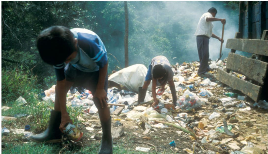
📷 Children working at a rubbish dump in Livingstone, Guatemala.

These groups can exhibit high levels of entrepreneurship, resilience and ingenuity. However, their work is unregulated and waste pickers are often a vulnerable demographic – typically women, children, the elderly, the unemployed, or migrants. 122 They also face considerable challenges: unhealthy conditions, lack of social security and health insurance, fluctuations in the price of recyclable materials, lack of educational and training opportunities and strong social stigma. 123