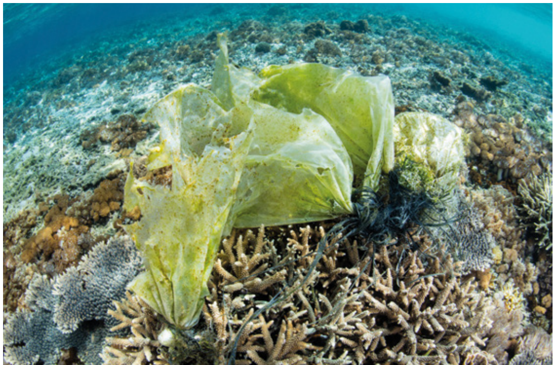
📷 A plastic bag on a coral reef.

These impacts threaten the long-term viability of reef ecosystems including reef-based fisheries, which are important for coastal communities. We discuss this impact on livelihoods in chapter 3. The scale of the problem is alarming. An estimated 11.1 billion plastic items could be entangled on coral reefs across the Asia-Pacific, with a projected increase of 40 per cent by 2025. 38