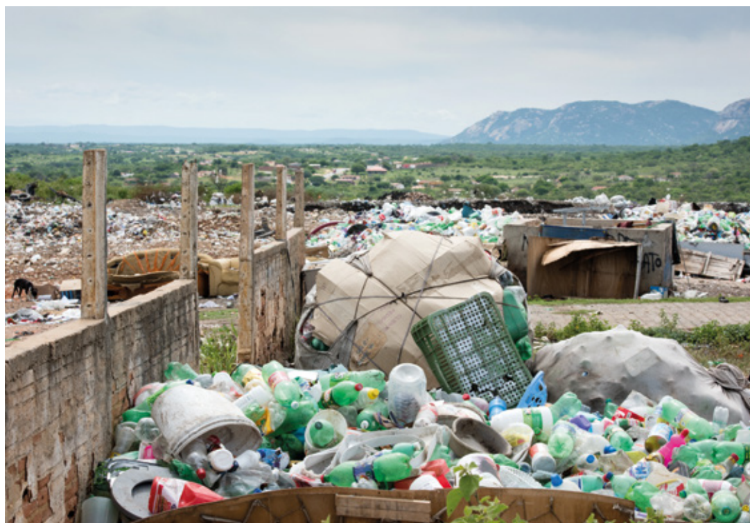
📷 A municipal waste dump in Brazil.