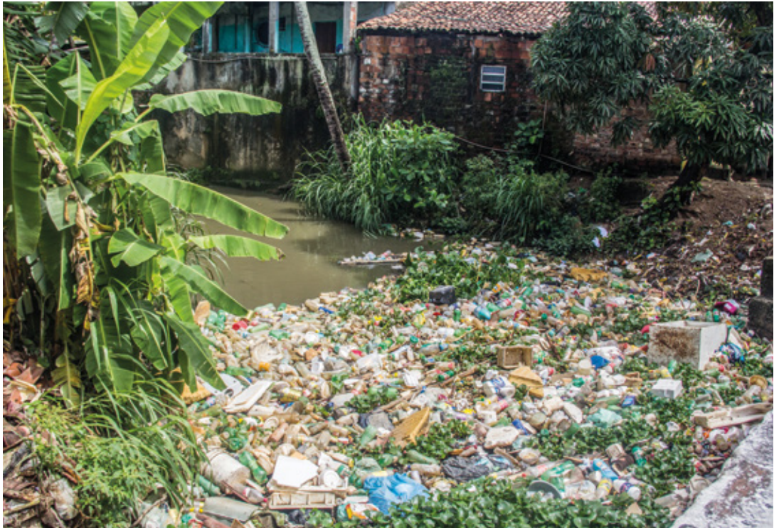
📷 The river Tejipto, in Recife, Brazil, is clogged with plastic waste. Tearfund partner, Instituto Solidare, have a project called 'clean river, healthy city', which is working to clean up the river.

Plastic pollution is creating a growing public health emergency in many towns and cities around the world. New research by Tearfund suggests that between 400,000 and 1 million people die each year in developing countries because of diseases related to mismanaged waste. 2 At the upper end that is one person every 30 seconds. Mismanaged waste, including plastics, harms people's health in developing countries in the following ways: