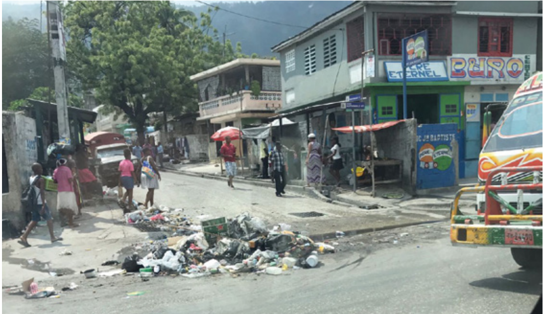
📷 In the absence of integrated sustainable waste management, waste collects in streets and public spaces in low- and middle-income countries. Port-au-Prince, Haiti.

In Maputo, Mozambique, a rapid increase in collection rates was achieved by inviting small community-based companies to provide waste collection in hard-to-reach areas, with collection fees staggered by income level. The city now has a collection rate of 80 per cent, one of the highest in its income group and a 'phenomenal achievement' according to the Global Waste Management Outlook . 197