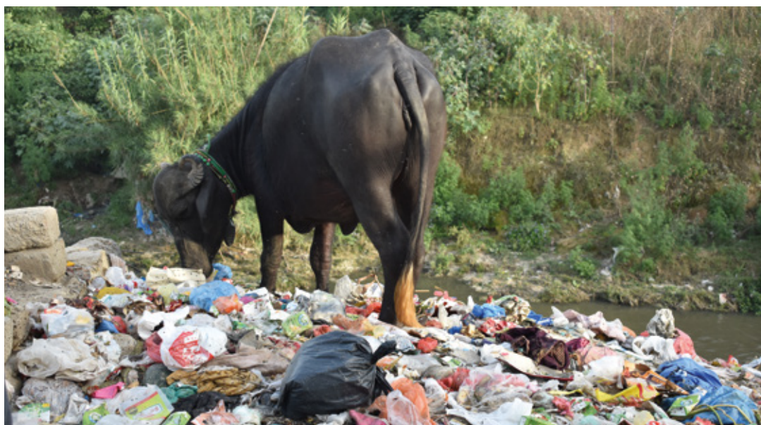
📷 A buffalo roams freely on a waste-covered river bank in Pakistan.

When plastic litters hedgerows, fields and waterways, animals can mistake it for food and eat it. Studies have found that up to a third of cattle and half of the goat population in the Global South have consumed significant amounts of plastic. 91 Research on abattoirs in Kenya shows that cows with plastics in their digestive system are a daily occurrence. In one case, a slaughtered cow had 2.5kg of plastic waste in its digestive system – about the same weight as a laptop. 92 When plastic is swallowed by animals, it does not decompose in their digestive tracts and cannot move through their guts. It leads to bloating, a host of adverse health effects and eventually death by starvation. 93 Alongside the evident suffering this causes the animals, this has dire economic consequences for farmers. 94