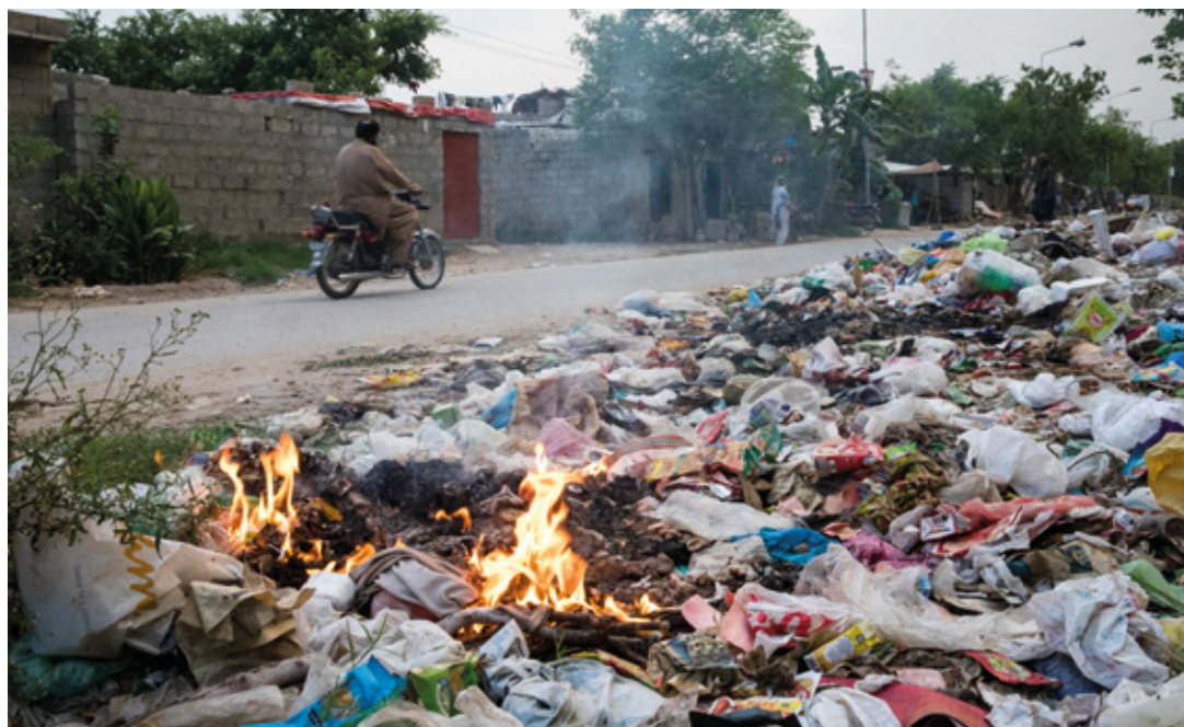
📷 Toxic fumes are released from burning plastic, but many communities have no other options to get rid of their waste.

In Ethiopia, a study showed that children from slums with uncollected waste were six times more likely to suffer from acute respiratory infections than those living where there were regular waste collections. 79