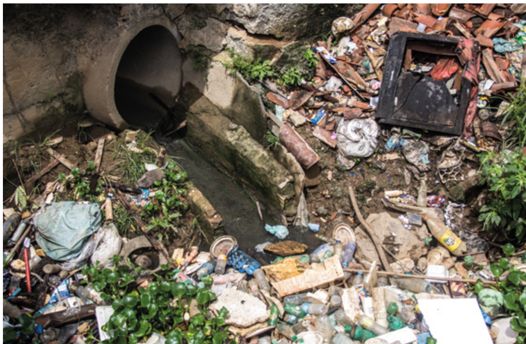
📷 A drainage channel blocked with plastic waste, Brazil.