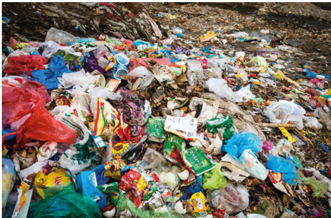
📷 Urgent action is needed to tackle the waste crisis.