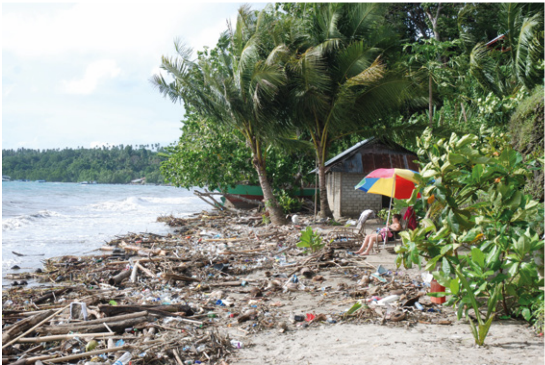
📷 A beach covered in plastic waste, Bunaken Island in North Sulawesi, Indonesia.

This field of research is still in its infancy, but it is already clear that plastic pollution in the ocean and on land has a direct impact on the livelihoods of people who are poor. In this chapter we explore the impacts of plastic pollution on livelihoods in three key sectors for many low- and middle-income countries: agriculture, fisheries and tourism.