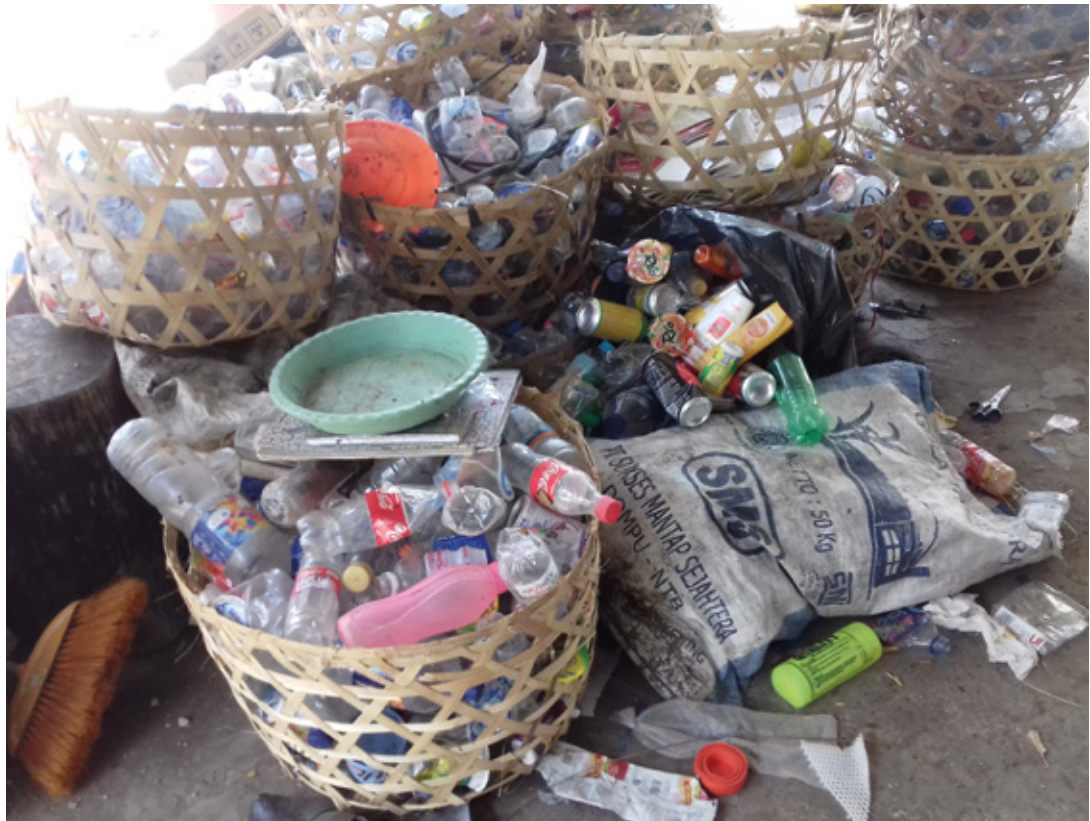
📷 Beach litter collected in Bali.

As many as 820 million people directly and indirectly rely on fisheries as a source of income to support food security, 97 so the human impact of these changes could be vast. Despite this, very little research has been conducted to assess the impact of plastic pollution on fishing communities. As long ago as 1992, the negative impacts of plastic pollution and marine debris on small-scale subsistence fishing communities and livelihoods were documented in Indonesia. 98 The study found that plastic waste impacted fishing activities through propeller entanglements, damage to fishing gear and injuries to people. The most direct impact was a decreased yield of fish caused by plastic pollution. But there were also indirect costs – increased expenditure (for example for repairs or for medicine for an injury) or an increased amount of time spent on fishing or fishing-related activities. The report also highlighted that for fisherfolk living at the subsistence level, even a minor decrease in fishing yield can mean that they cannot provide for their own basic needs such as food.