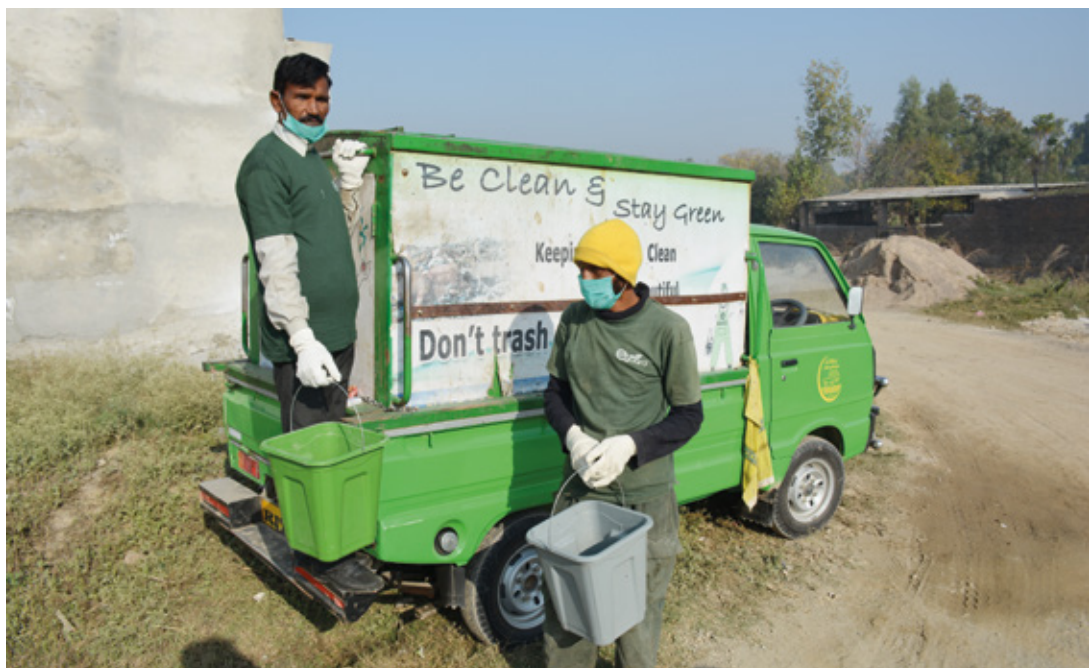
📷 'Environment guards' collect household waste and transport it to the IRRC in Islamabad.

When starting a project such as the IRRC, it is important to make sure no harm is done to those already working informally as waste pickers. Instead, the centre makes sure it employs existing local waste pickers among its staff, providing them with safer and better-paid employment. The centre calls their waste workers 'E-guards' (Environment guards) and supplies them with a protective uniform, giving them dignity and respect in the community.