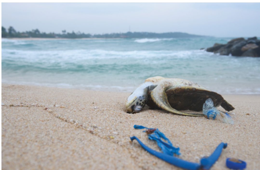
📷 Dead sea turtle among ocean plastic waste.

The conditions of the marine environment cause plastic to break up into smaller and smaller pieces that are easily ingested by marine animals, who can mistake them for food. 27