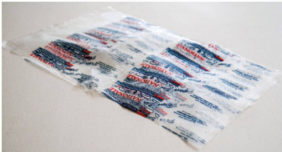
Water sachets such as these are ubiquitous in many low-and middle-income countries.

An immediate solution to this problem is for the LDPE sachets to be collected and recycled. However, the obvious longer term – more economically and environmentally sustainable – solution is for governments and donors to also increase investment in water, sanitation and hygiene (WASH), which will mean people can access safe water without having to buy it in plastic sachets.