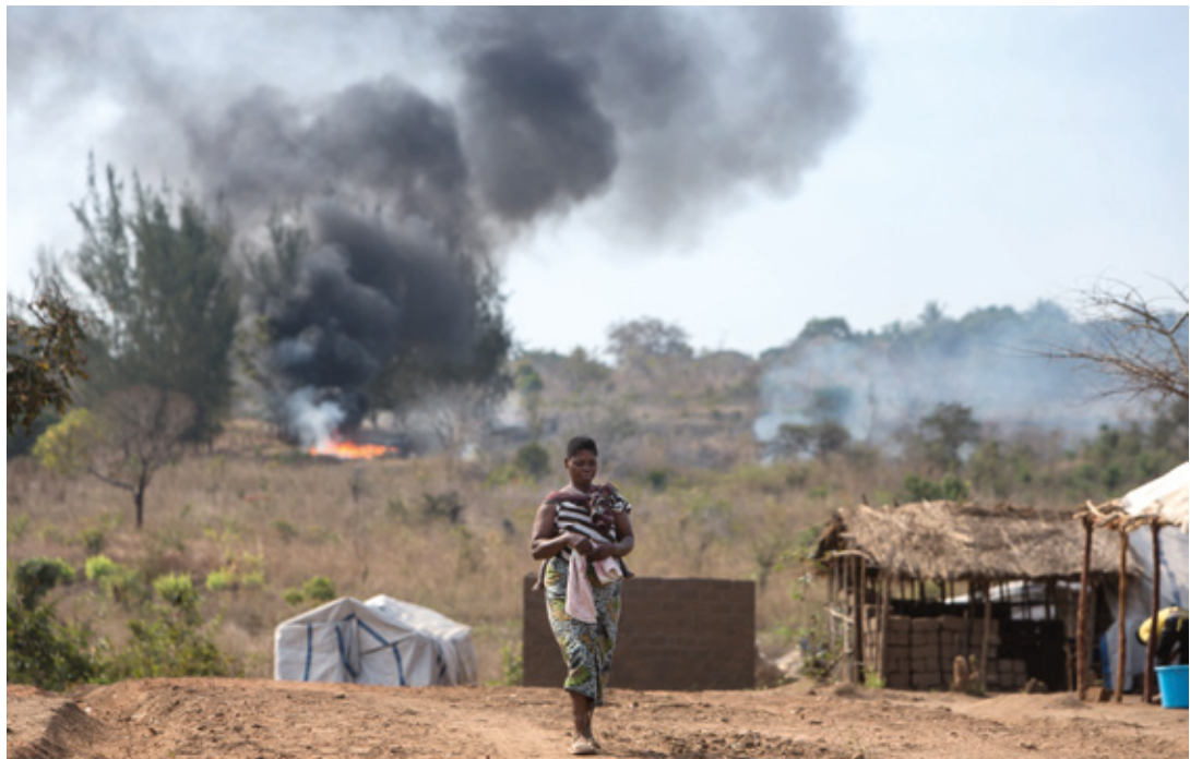
📷 A woman and her baby with burning rubbish behind her in the Mocuba District of Mozambique.

Plastic pollution is also contributing to climate change . While global plastic production emits 400 million tonnes of greenhouse gases each year (more than the UK's total carbon footprint), according to the World Bank solid waste was responsible for a further five per cent of global emissions in 2016. The true figure may be much higher: emissions from backyard burning of waste are not included in most current emissions inventories, despite research revealing that in several developing countries they dwarf all other sources of carbon emissions combined.