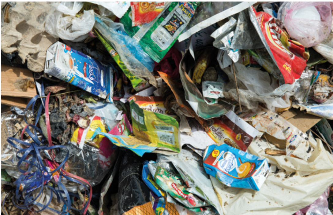
📷 Lays chips top right, owned by PepsiCo and Everyday milk at the bottom, owned by Nestlé, in packaging collected by the Community Recycling Centre in Islamabad, Pakistan.

There are many problematic single-use plastics being distributed by MNCs in low- and middle-income countries where there are inadequate or non-existent waste management systems. Here we highlight two examples: sachets and PET bottles.