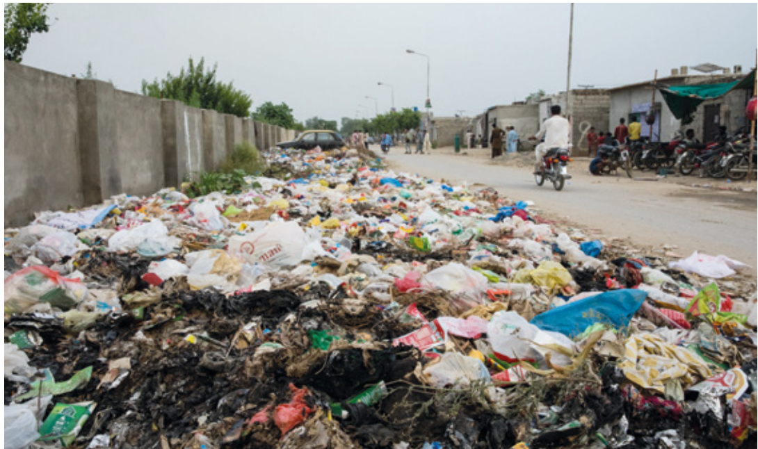
❏ Islamabad, Pakistan. The take-make-dispose model of economic development has been exported across the globe by high-income countries.

Current economic models, with large subsidies given to the oil and gas sectors (virgin plastic is made from crude oil and natural gas), depress the price of plastic – driving supply. The G7 alone shell out 100 billion USD per year in subsidies to the production and use of coal, oil and gas. 170