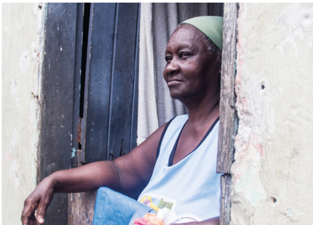
Community member in the Coqueiral neighbourhood of Recife, Brazil, whose house regularly floods due to waste blocking the river and more frequent rains.

Things look extremely bleak if the world continues with business as usual.