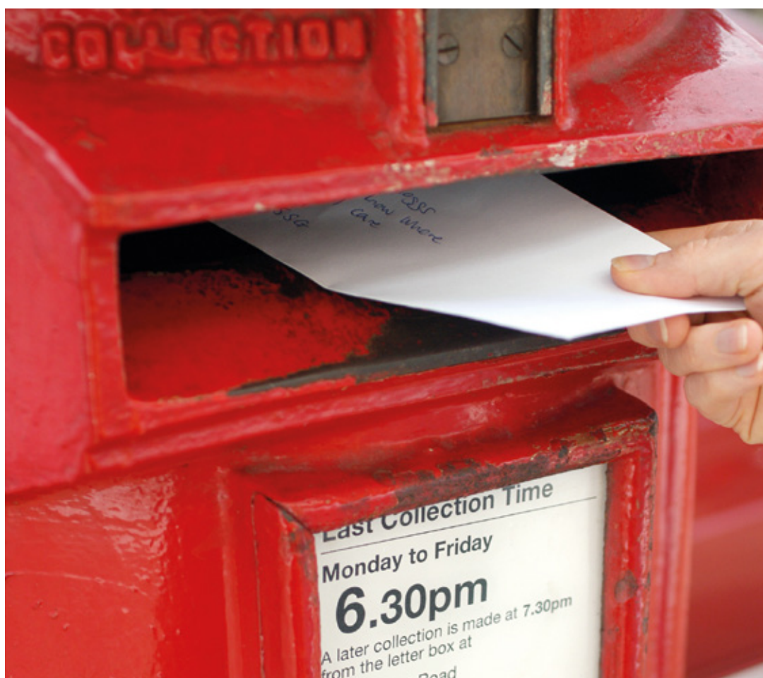
By taking campaign actions, such as writing to companies and MPs, calling for change, citizens can make a difference.

While the lion's share of responsibility lies firmly at the feet of the MNCs and high-income governments, each person and community has a role to play in tackling the plastic pollution crisis. Indeed, as Tearfund has observed: 'When extraordinary things are achieved against apparently impossible odds, it's often because of a shift in values and a civil society movement that pushes for change.' 214