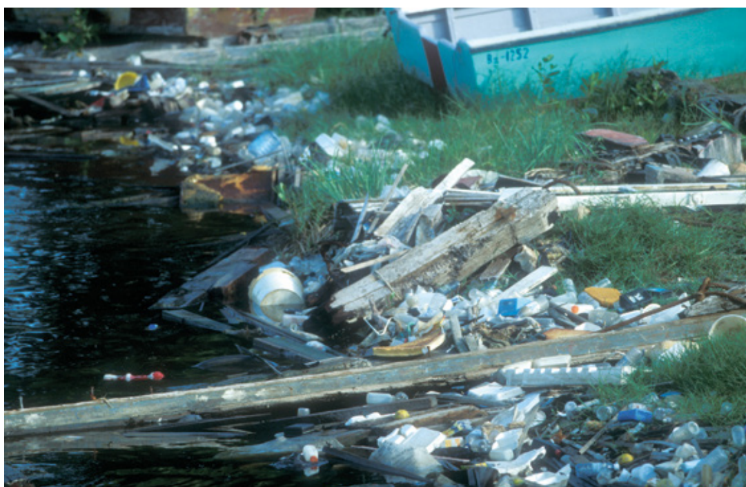
📷 Plastic pollution in Guatemala.

Plastic pollution is also wreaking havoc on land as plastic litters fields, waterways, hedgerows and trees across the globe. Some plastics are extremely persistent in the environment with studies suggesting that certain plastics can take thousands of years to decompose in the environment. 39 This contaminates soil and water and poses significant ingestion, choking and entanglement hazards to wildlife on land, and in freshwater systems as well as in the ocean. There is evidence suggesting that the impacts of microplastics on freshwater animals can be as diverse and harmful as those for marine species. 40 According to recent studies, microplastics in terrestrial environments could affect animals that play a major role in key ecosystem processes, such as soil organisms or plant pollinators. 41 The transfer of plastic debris along food chains has also been demonstrated for terrestrial systems, 42 which could have implications for human health (see chapter 2).