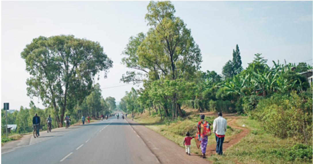
📷 The route from Kigali to Eastern Province, Rwanda. Kigali is now considered by many to be the cleanest city in Africa.

Rwanda outlawed the use of non-biodegradable plastic bags in 2008. At the time, many people asked: 'Is this really necessary? Surely Rwanda has bigger and more important things to worry about?' A few years before that, though, farmers were losing their livestock to plastic bags at an alarming rate. Rivers, streams and drains were blocked by plastic bags. Even farmers' fields were choked by these bags.