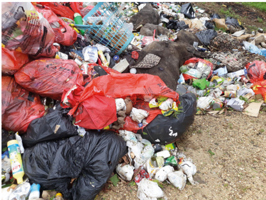
📷 Nappies in discarded waste in Vanuatu, South Pacific.

According to the UN, living among uncollected waste doubles the incidence of diarrhoeal disease . 67 In many countries, it is common practice to dispose of child faeces as part of the household rubbish – either in plastic bags or in disposable nappies. 68 Faeces may also be in the environment through flooding caused by blocked drains and waterways (as mentioned previously).