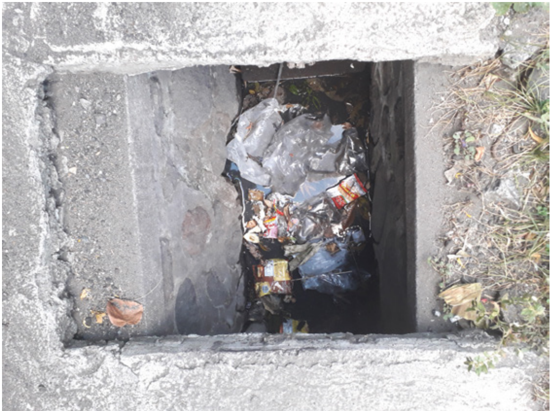
📷 Mixed plastic pollution – including plastic bags – in a storm drain, Bali. A growing number of countries have bans or taxes in place for single-use plastic bags.

Governments can also provide incentives for innovative product design that aims to reduce the plastic content of products or improve recyclability, along with shifts to viable alternative, non-plastic materials (while being aware of the negative impacts that some proposed alternatives may have); 205 and they can incentivise the use of reusable and refillable items (such as food containers and drinking bottles), through awareness, subsidies for refillables and levies for non-reusable items through the supply chain.