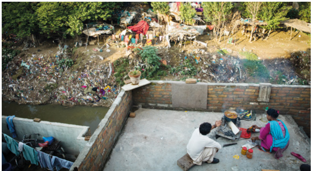
📷 Many communities in low- and middle-income countries have no safe way to manage their waste.

In this chapter, we explore the health impacts of the plastic and waste crisis in more detail. We highlight five core ways the health and lives of billions of poor and vulnerable people – particularly children – are put at risk by mismanaged household waste. We also highlight a sixth potential health hazard, which is potentially huge, but as yet little understood: the introduction of microplastics into the food chain.