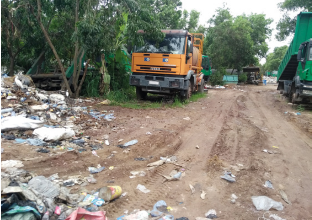
📷 Maintenance has ceased at this sanitary landfill site. There are no other sanitary landfill sites in DRC.

Kinshasa, a city of some 12 million people, is the capital of DRC, one of the poorest countries in the world with a per capita GDP in 2014 of just 479 USD.