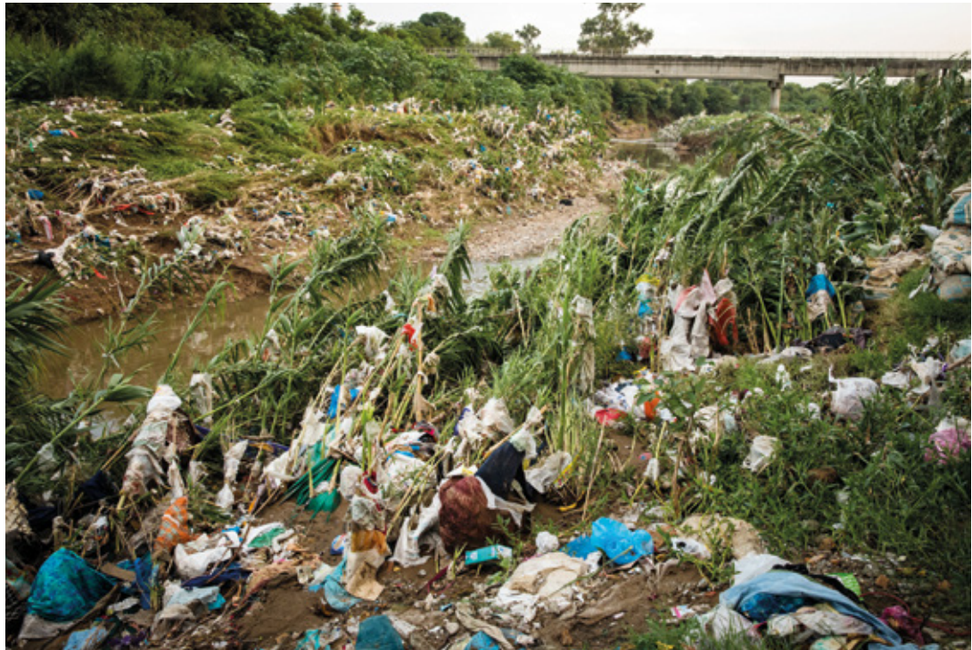
📷 Plastic waste litters river banks and open spaces around the globe.