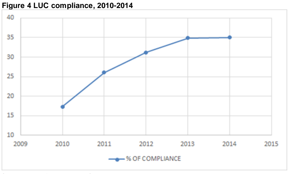
Figure 4 shows the corresponding compliance levels, illustrating that the compliance rate doubled in just three years, from 17.4 per cent in 2010 to 34 per cent in 2013.