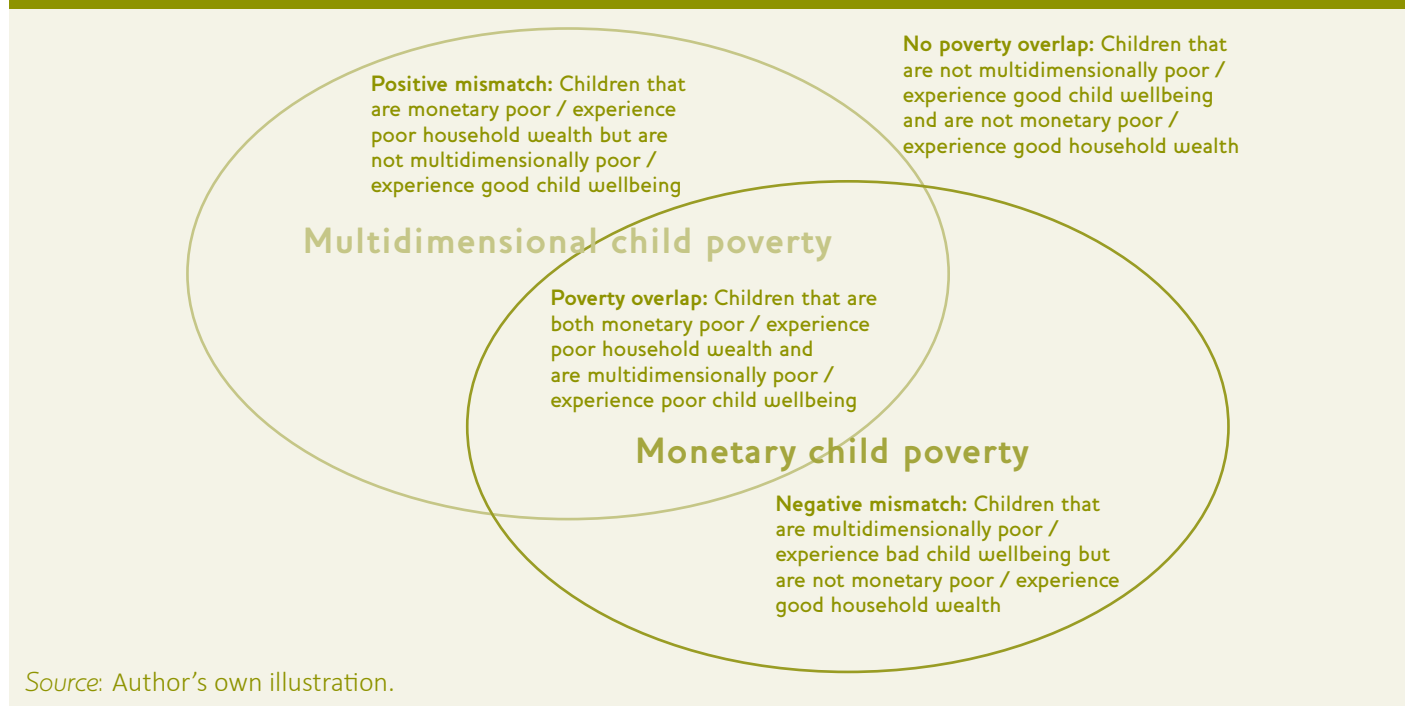
Figure 1 Categories of child poverty overlap and mismatch

Appraisal (PRA) toolkit (Grandin 1988). PRA is an approach to understanding and analysing poverty based on explicit participation of local rural (and urban) people themselves, aiming for a more activist and bottom-up as opposed to extractive approach (Chambers 1992). Community wealth ranking exercises ask community members to list criteria or indicators of wealth (these commonly include livestock, land and income) and to indicate what values of those criteria constitute low, average or high wealth status (e.g. number of goats, cows and oxen). Against the backdrop of these criteria and their thresholds, community members are asked to rank households in the community according to their wealth status. The exercise developed for the purpose of this research extends this tool as it asks community members to undertake this assessment for household wealth and child wellbeing, 3 leading to the 'community child poverty profiling exercise'.