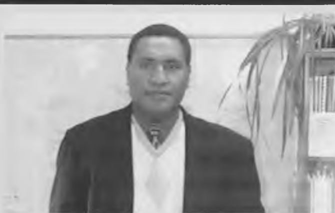
A distinguished alumnus visits IDS. Chris Haiveta, MP8, who is Deputy Prime Minister of Papua New Guinea and also Minister of Planning and Implementation, spent a day at IDS after attending the Commonwealth Heads of Government Meeting in Edinburgh in October.

enable the people of the UK to fulfil their potential through food policies and practices that enhance public health, improve the working living environment, and enrich society.'