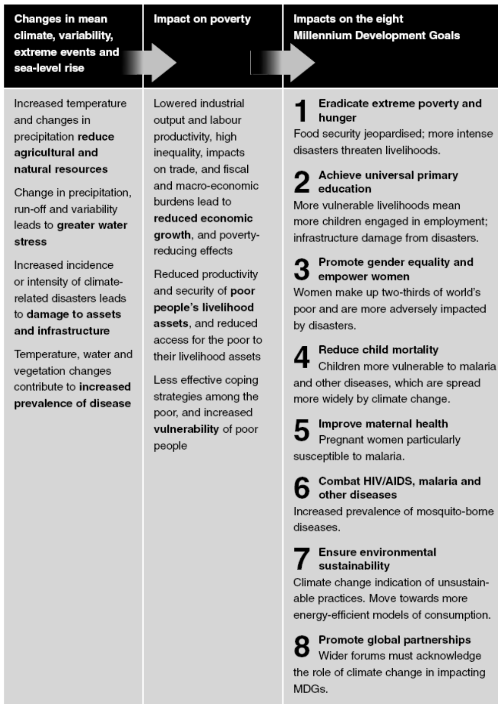
Figure 1 Potential impacts of climate change on poverty and the MDGs