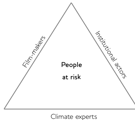
Figure 2 Key members of collaborative teams for video-mediated adaptation

change adaptation, inspired by experiences in health risk management and illustrated by four Red Cross case studies on climate change.