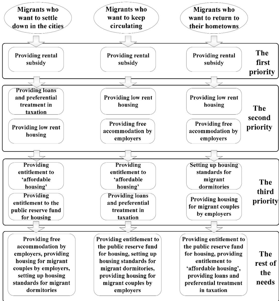
Figure 2 Four levels of need for housing security policies by respondents' settlement intentions