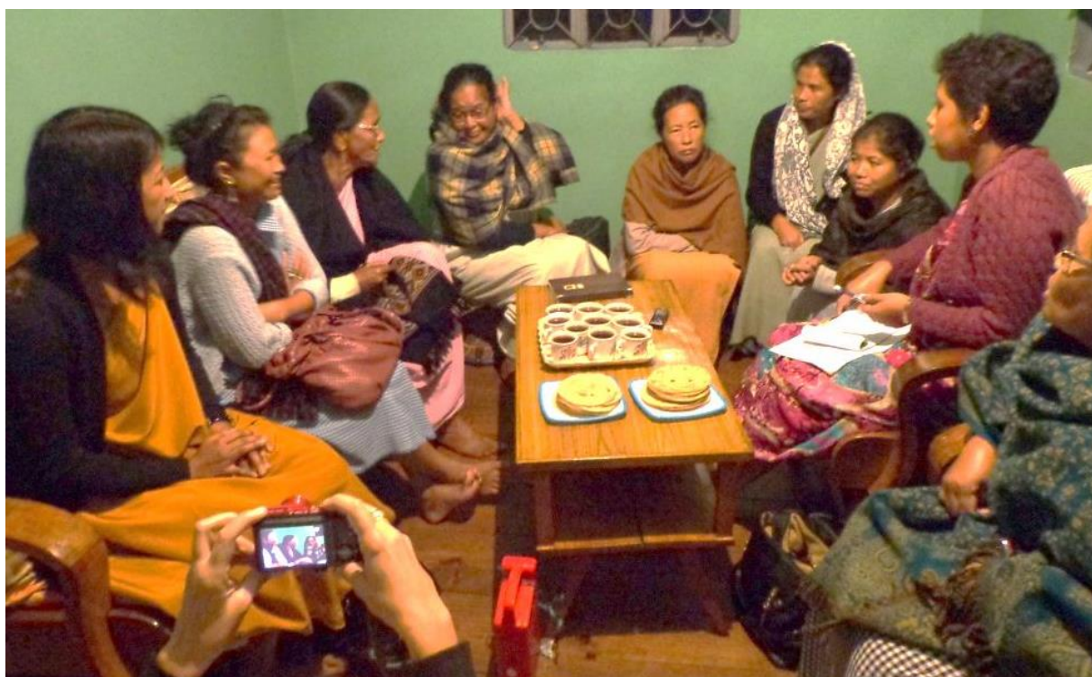
Figure 3.1 FGD in progress