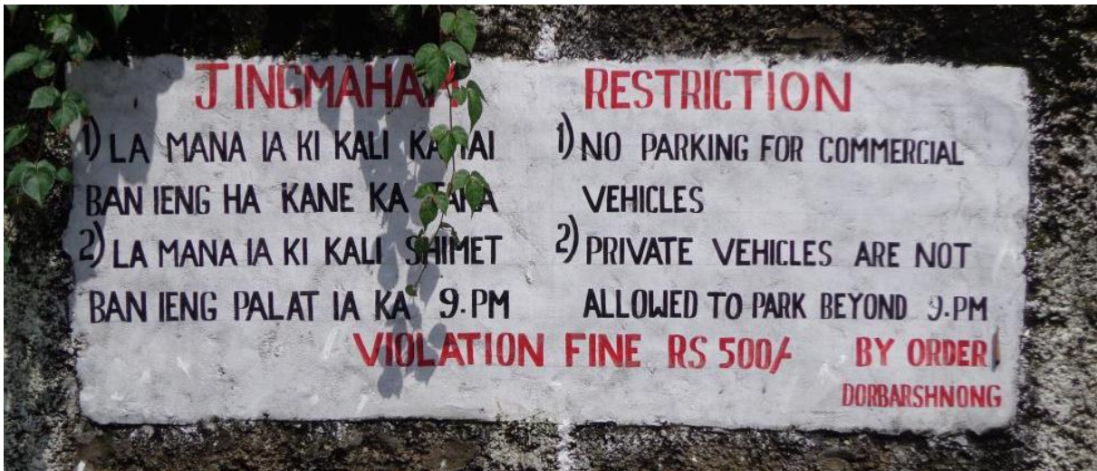
Figure 4.1 Notification by dorbar shnong , village council