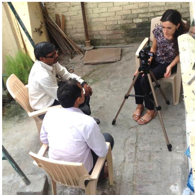
A MASVAW participant with CHSJ and IDS researchers capturing his personal journey of activism through a video interview.

See further reflections from MASVAW activists shared through film-based presentations at: http://interactions.eldis.org/masvaw-activist-testimonies .