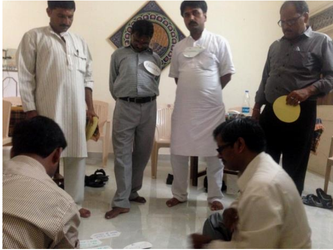
MASVAW activists clustering research questions to provide a focus for the continued case study inquiry.

The second phase of the workshop saw a conceptual shift from individuals' activism to a focus on collectivity and the wider social, economic and political context within which their activism takes place.