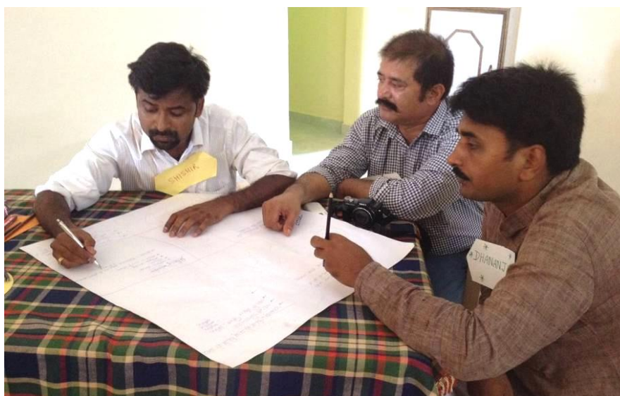
MASVAW activists analysing the campaign's strategies for action on gender-based violence.

How we know if it is working: Change can be assessed where schools and colleges are providing space and time for sensitisation and training activities. Research will help assess the reduction of violent behaviour by the men reached by the campaign. It is also important to measure not just the number of youth involved in the training workshops, but also whether, why and how they are working with others in their communities to engage them in the campaign.