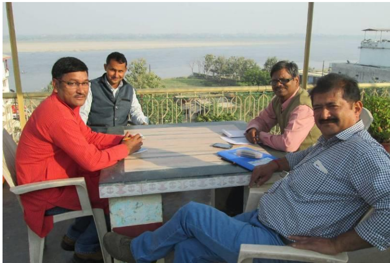
MASVAW activists deliberating on strategies for change with Panchayat institutions to end gender-based violence.