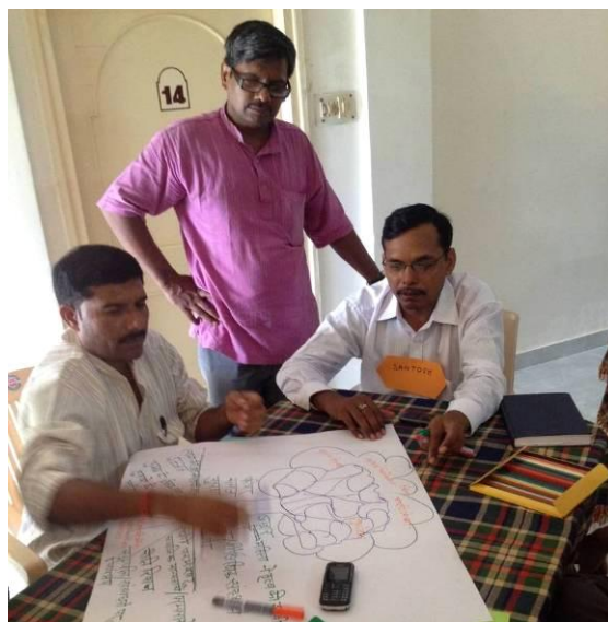
MASVAW activists working on their problem tree to analyse gender-based violence in Uttar Pradesh.

The root causes of gender inequality and violence were articulated in relation to social norms and institutions – the family, religion (including the caste system), politics – that maintain and uphold the patriarchal gender order. The legitimisation of violence as a means of policing this gender order and maintaining the interests of men was of significant concern.