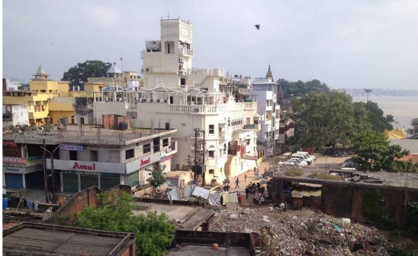
View of the city of Varanasi where the movement mapping workshop took place.