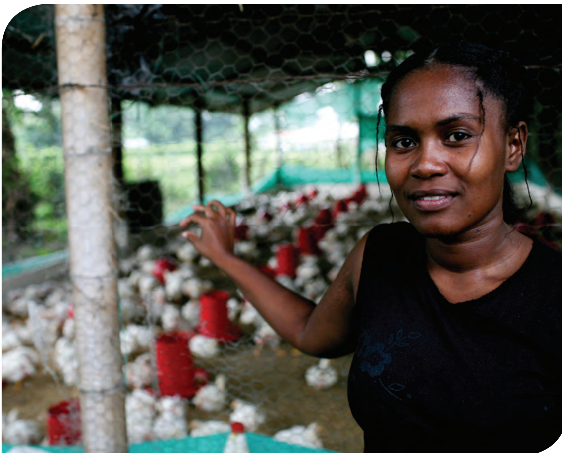
Raising poultry in Colombia