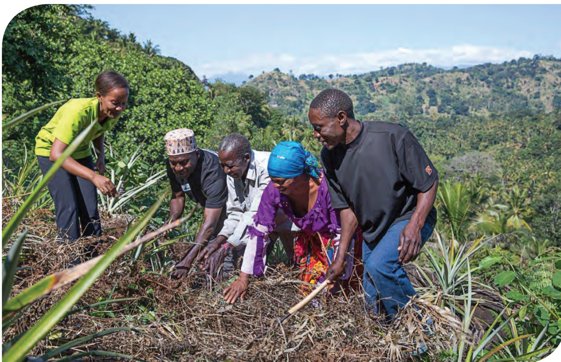
Training of the Tanzanian Network of Small Scale Farmers Groups in better agricultural techniques, Morongoro, Tanzania