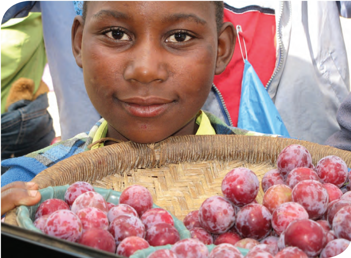
Girl selling plums by the roadside, Malawi