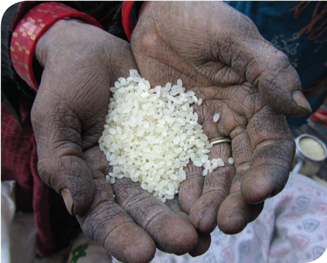
A woman collects her rice ration as part of the Nepal Food Corporation's food distribution programme