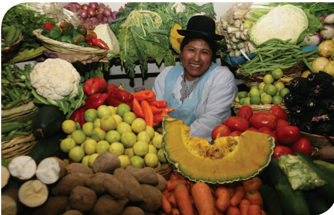
Agricultural biodiversity in a Peruvian market