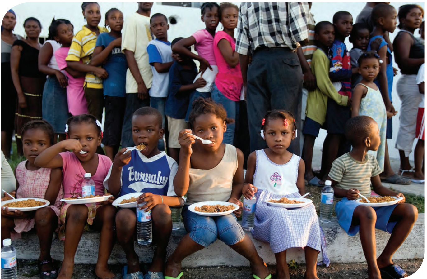
Children in Cité Soleil receive meals