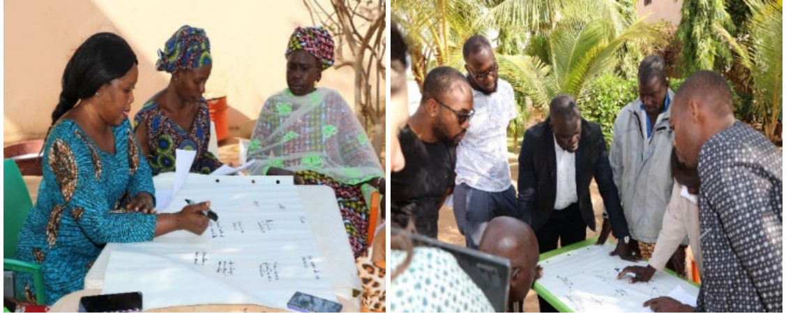
Figure 2.1 Drawing a system map for each story