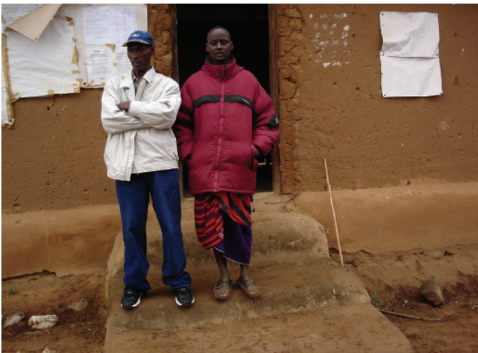
The Village Chairman and Executive Officer outside their Lendanai village office

“ We clearly cannot improve quality of life and social well-being without strong, well governed, effective and accountable local government authorities. ”