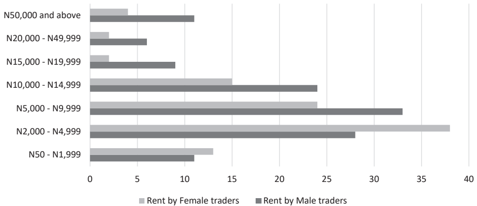
FIGURE 1 Annual rents paid by female and male market traders, in Naira.

Somebody can have a shop where the goods are worth more than N10 million [US $28,000] and he will pay just N1,000 [US$2.80]. The neighbor can have products that are less than N200,000 [US$554], but they pay the same amount [of tax]. So, there is no equality in taxing there.