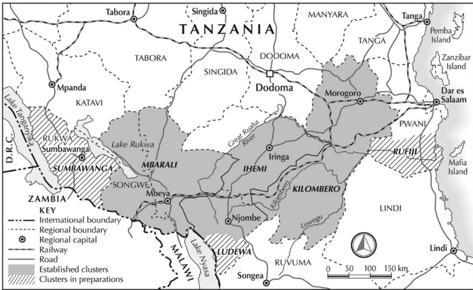
Figure 2. The map of six clusters of SAGCOT.