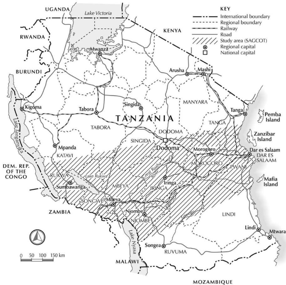
Figure 1. The map of Tanzania showing SAGCOT area.

example, while the previous government of President Jakaya Kikwete prioritised agriculture and formulated various initiatives, the current government of President John Magufuli focuses more on an industrialisation agenda. 17 In addition, local dynamics – such as the role of an active civil society and arrangements around land-rights that promote the interests of smallholders – have produced complex and varied outcomes. These dynamics foreground the importance of a political economy approach in understanding the politics of corridor-making, where particular attention is placed on the variegated interests, practices and outcomes in particular sites of investment.