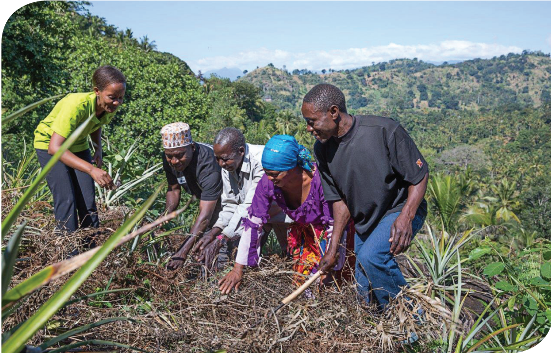
Training of the Tanzanian Network of Small Scale Farmers Groups in better agricultural techniques, Morongoro, Tanzania