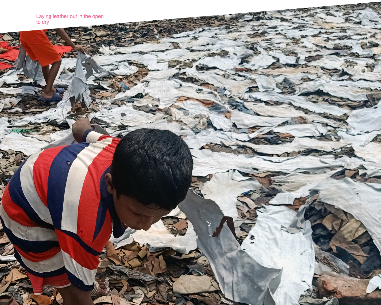
Laying leather out in the open to dry