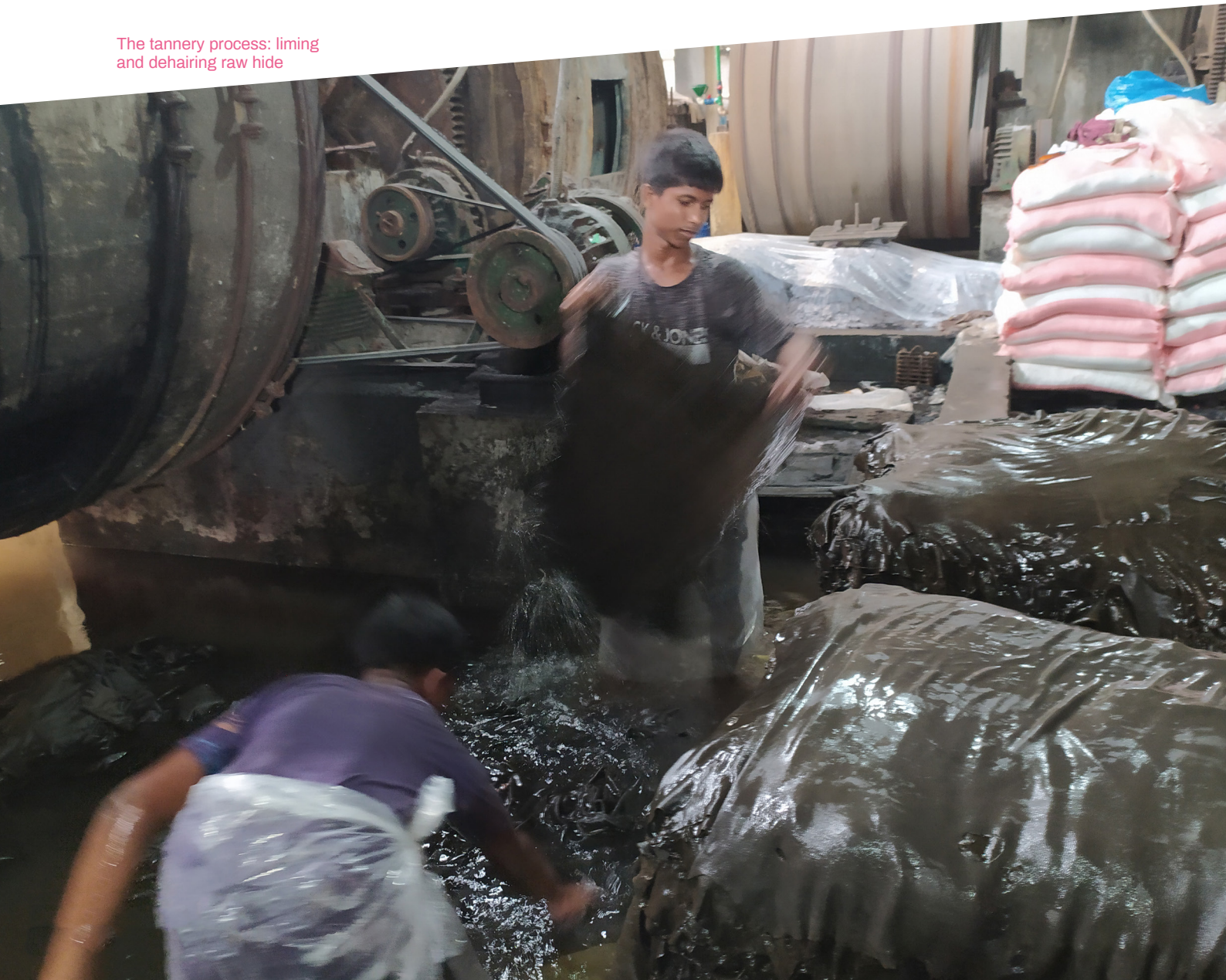
The tannery process: liming and dehairing raw hide