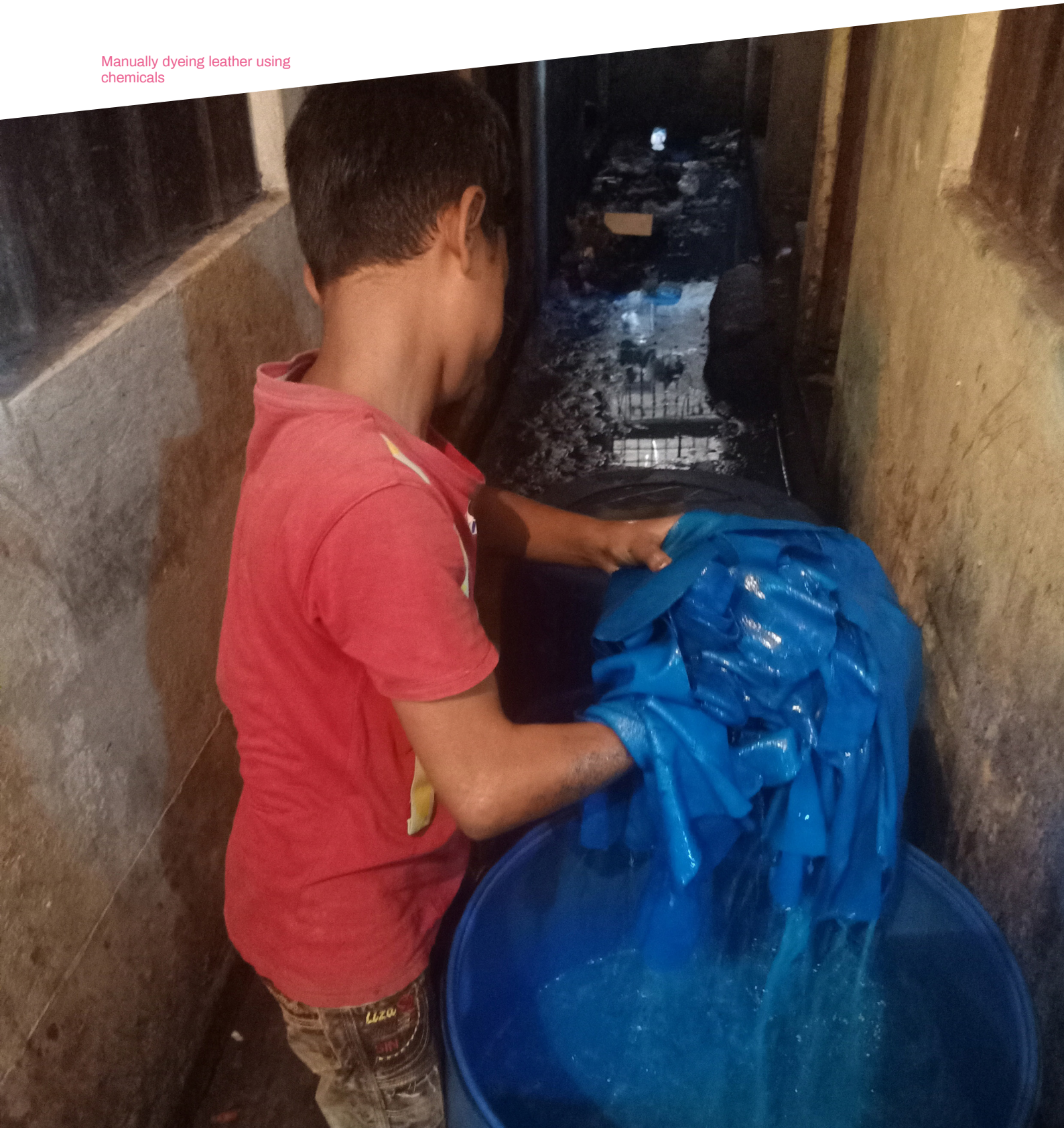
Manually dyeing leather using chemicals