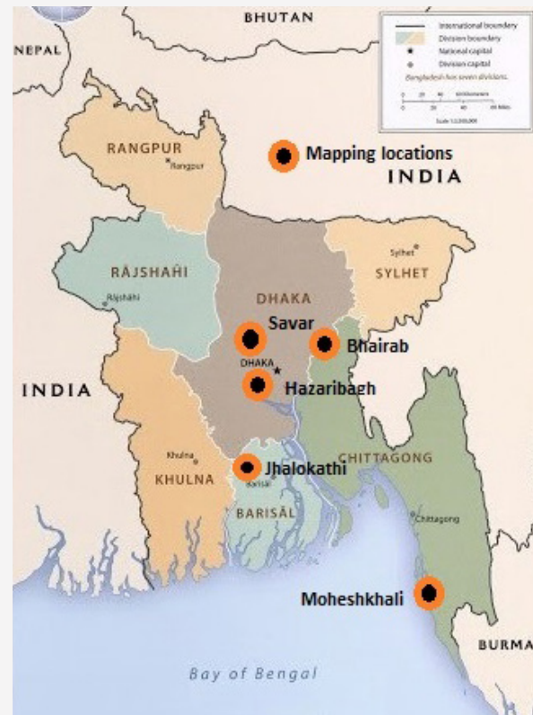
Figure 1: Study locations

Moreover, this billion-dollar industry has a problem with child labour. The national Child Labour Survey of 2013 estimated there are 3.45 million working children in Bangladesh, 1.28 million of whom are working in hazardous conditions (Bangladesh Bureau of Statistics 2015). A recent survey of eight slums in Dhaka city found that 34.6 per cent of all children living in slum areas are engaged in the worst forms of child labour (WFCL). It was also found that 59.1 per cent of children engaged in WFCL are directly or indirectly linked to the global supply chains of garments and leather products (Maksud, Hossain and Arulanantham 2019).