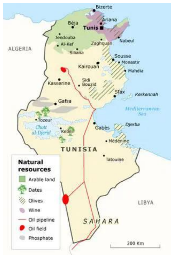
Figure 2. Tunisia's mineral and agricultural resources