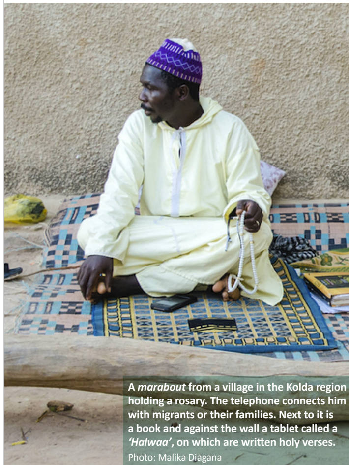
A marabout from a village in the Kolda region holding a rosary. The telephone connects him with migrants or their families. Next to it is a book and against the wall a tablet called a 'Halwaa', on which are written holy verses.