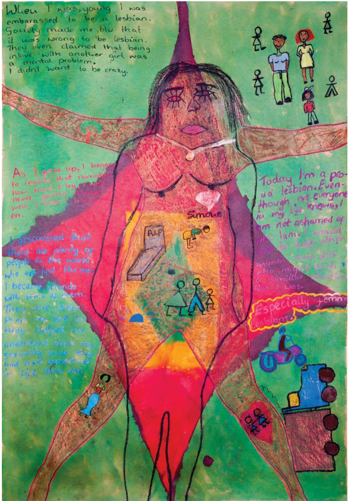
Petunia's body map: Queer Crossings