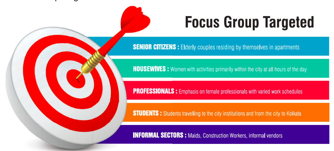
Figure 2: Citizens' Groups targeted in the Consultation Process

The details of the annexure include a visual representation of the citizens' 'focus groups' targeted in the consultation process, which included the poor and vulnerable people primarily in the fifth category of those employed in the 'informal sectors' (see Figure 5.2).