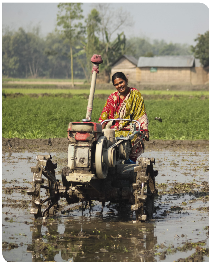
↑ A woman farmer using a mechanised tractor for rice cultivation in Domar, Bangladesh.