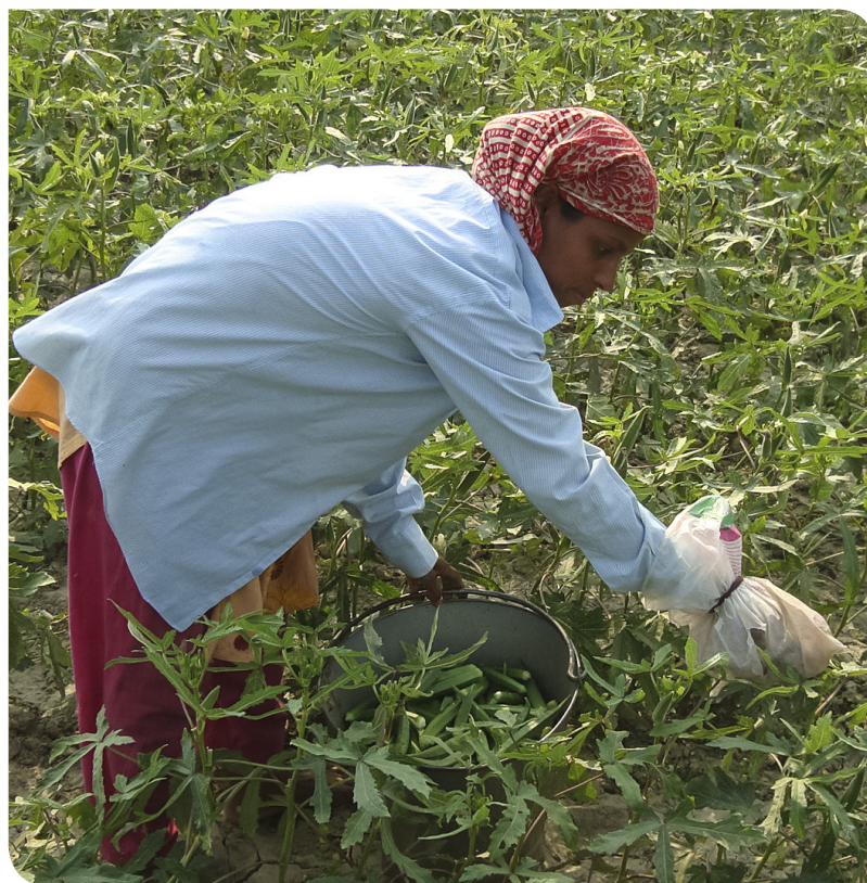
↑ A woman farmer harvesting vegetables.

Household income was not equal across agro-ecological zones, with coastal areas of Bangladesh found to be less dependent on agriculture. Per capita income has been increasing in coastal areas of Bangladesh, led by remittance (money sent home by migrant