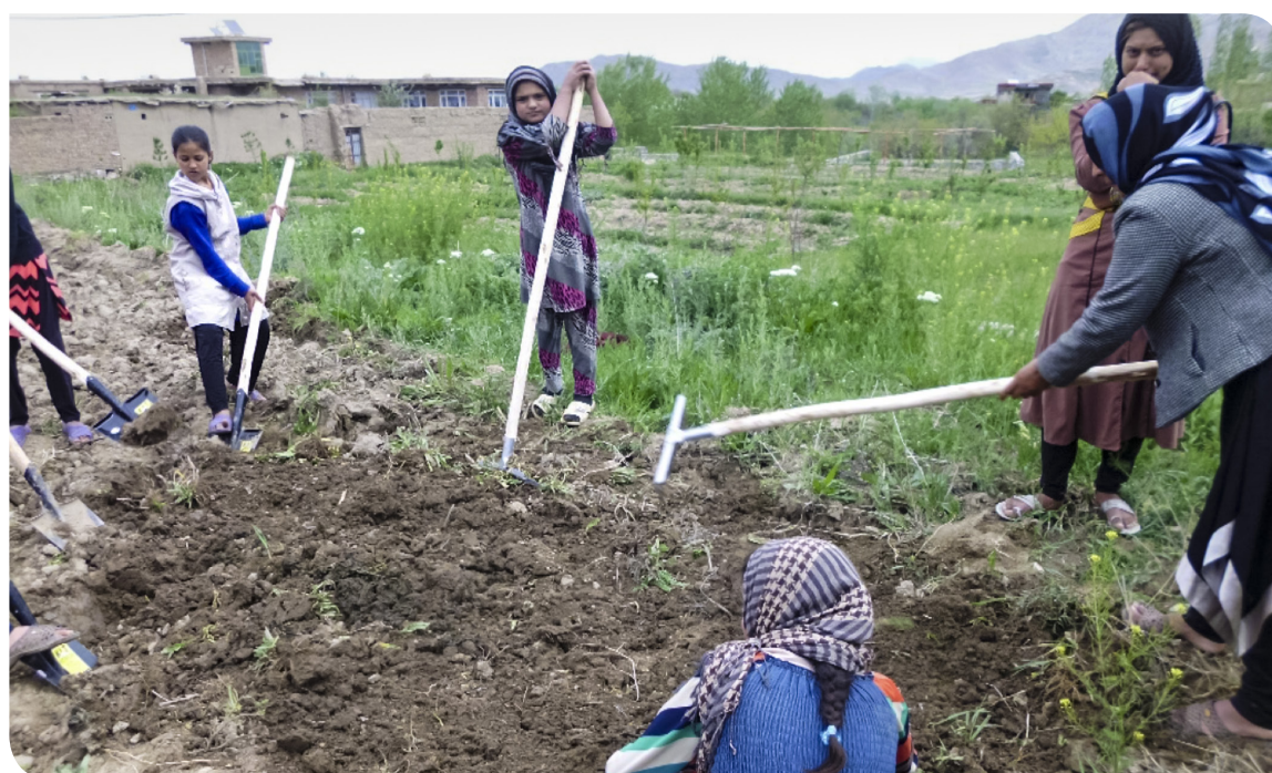
➦ Preparing the land for vegetable cultivation. A scene from Kabul province, Afghanistan.

“For many rural South Asian women, global efforts for the recognition of women's contribution to the care economy, or for the greater visibility of women's reproductive labour, is a step too far.”