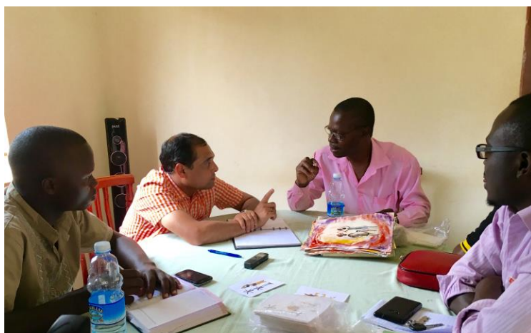
A blind painter at Kampala who acquired his disability as a result of an accident faced less discrimination than persons who were born with a disability.