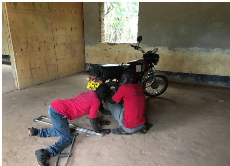
Skills development relevant for the local markets is key, particularly for young persons with disabilities, so they can pursue both employment and entrepreneurial opportunities.