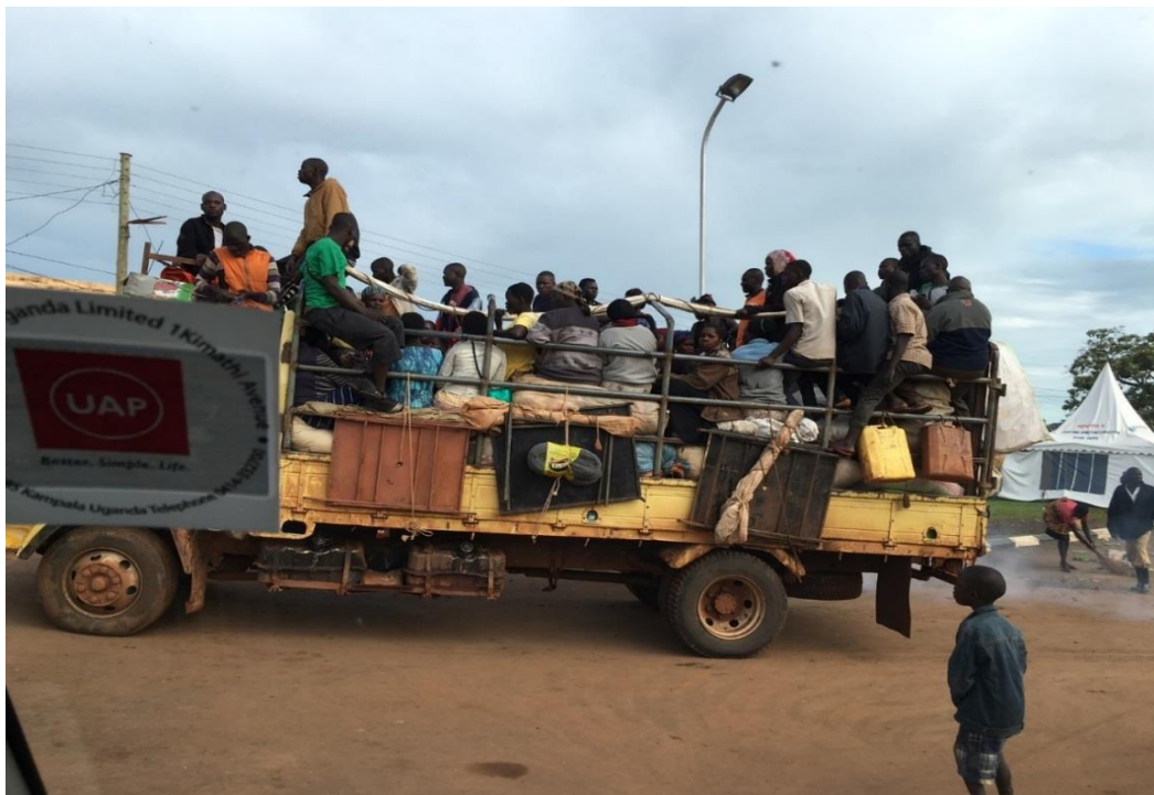
An overcrowded truck loaded with traders and farm produce: the most common medium of transportation of goods to rural markets in Gulu – and impossible for most traders with a disability to access.

former internally displaced people struggling to survive with poor infrastructure, transportation, electricity and communication networks, and weak markets. The situation is even more precarious for persons with disabilities, who face additional barriers in accessing physical capital. For instance, trucks were the only means of transportation from the remote rural parts to the trading centres such as Gulu. Below is an image of a truck filled with traders who were on their way to buy farm produce from rural farmers. If you were a trader with disability, then you had to compete for space in this environment. There were no concessions because you were a person with disability. Similarly, if you were a farmer who wanted to bring your produce to a bigger market such as Gulu, you had to use these very crowded trucks.