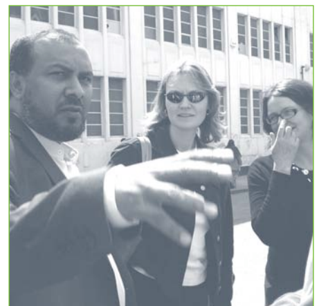
Visit to London Citizens

The workshop participants visited Canary Wharf and the site for the London Olympics, they met the organisers of the 'Living Wage' and 'Strangers into Citizens' campaigns, and visited City Hall to find out what the Mayor's Office thought about London Citizens. They saw a positive working relationship with the Mayor of London and also with other elected representatives including members of the Green Party.