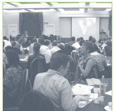
June 4th policy dialogue event

It is more empowering to move from opposing things to proposing solutions. Working locally to develop solutions to problems or draw up alternative plans shows what is possible and can transform the debate.