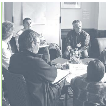
Group discussion at Lewes

Six groups of participants each took one theme and explored the strategies and solutions for tackling the challenges.