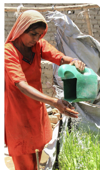
▶ Growing a way to self-sufficiency.

These findings have important policy implications and the TANDI framework is a useful starting point to understand the agriculture–nutrition links in Pakistan. However, the authors establish that assessing progress along any particular pathway between agriculture and nutrition reveals that there are a wide range of intervening processes and conditions.