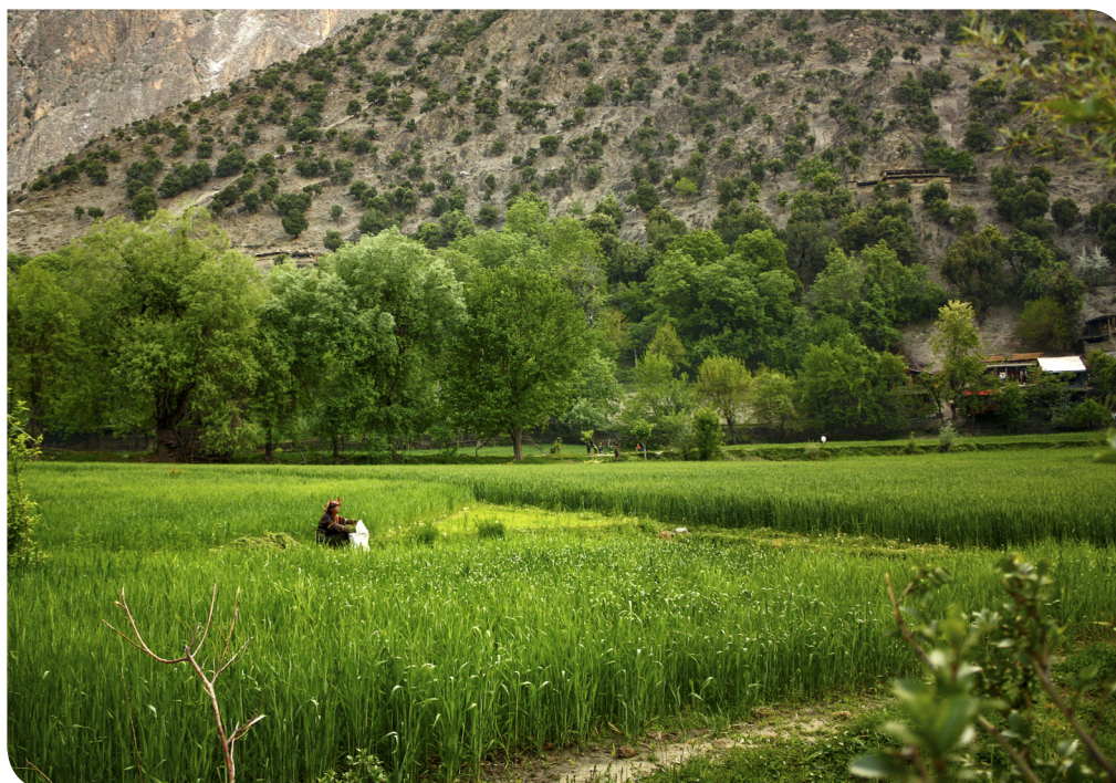
◀ Kalasha woman tending to her fields.

The seven pathways identified by TANDI are: