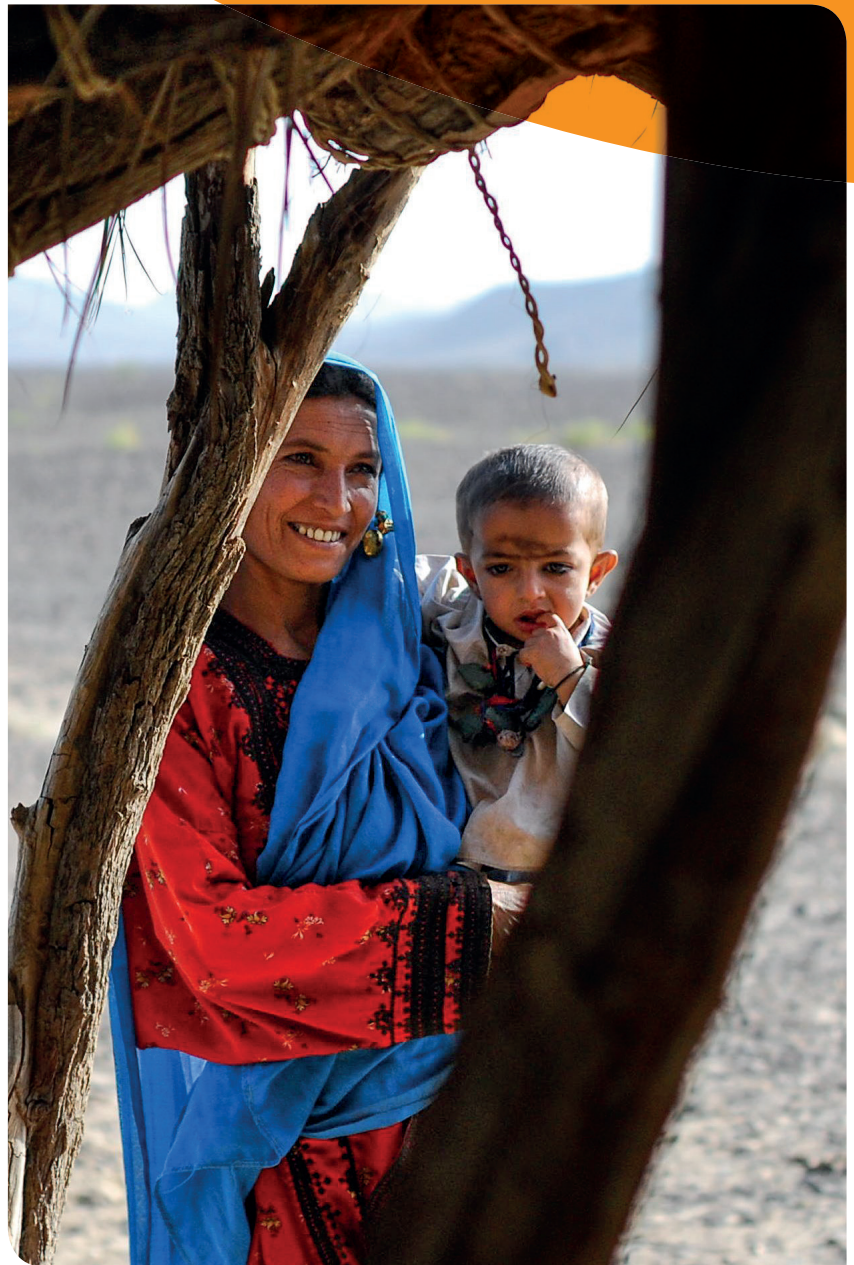
▲ A village woman with her son. AHSAN

Readers are encouraged to quote and reproduce material from issues of LANSAs briefings in their own publication. In return, LANSAs requests due acknowledgement and for quotes to be referenced as above.